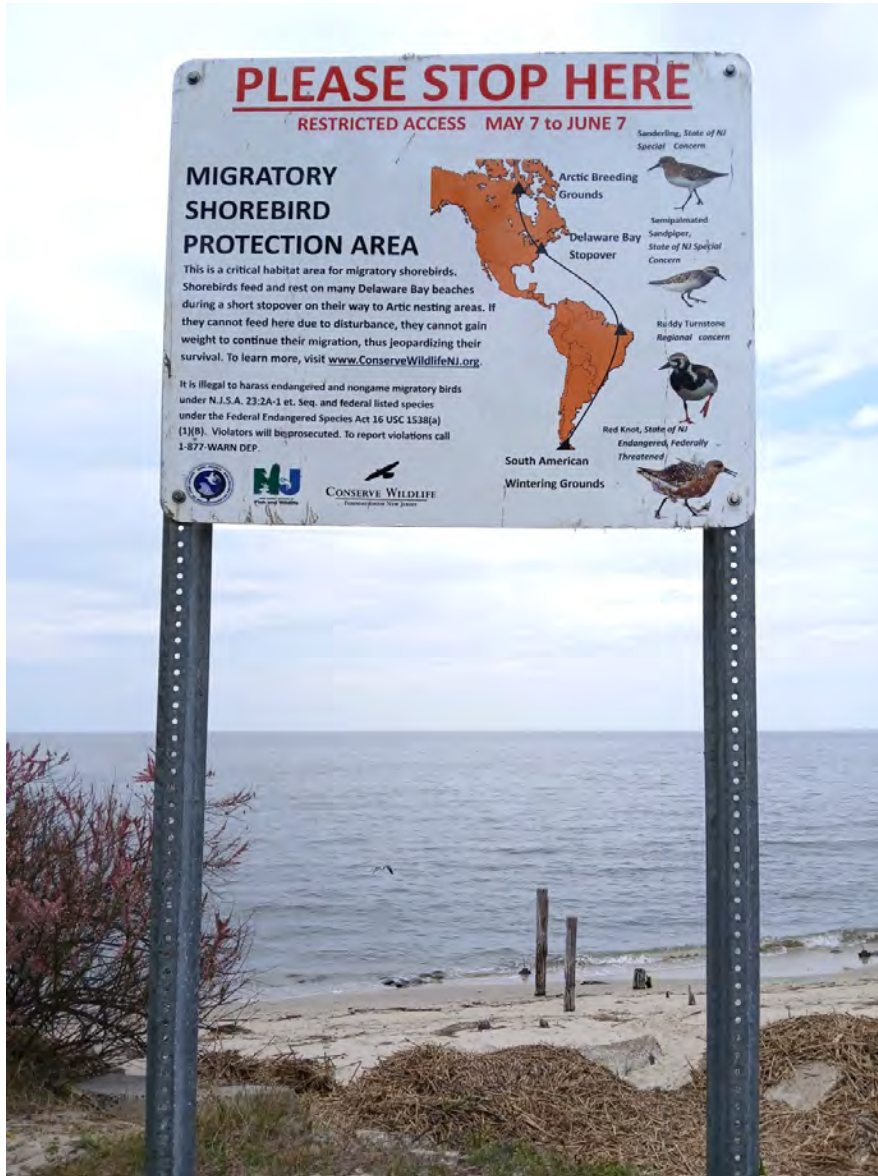
Bayshore signage on protected beaches explains the migratory route of shorebirds and the dates of restricted access.

away from accessible food resources. In fact they will.