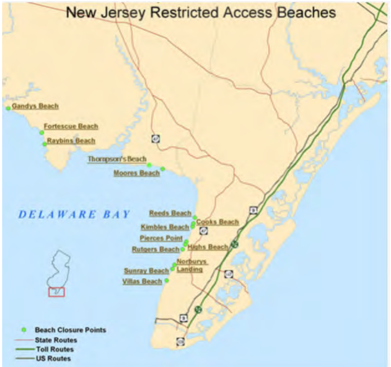
This map by NJ Fish and Wildlife shows the beaches where the new rule protecting shorebirds will be enforced. The protected zones span specific critical habitats from the Villas north to Gandy's Beach.