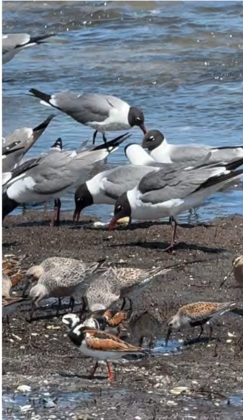
Laughing gulls, red knots, ruddy turnstones, and dunlin, all feasting on the Delaware Bayfront.