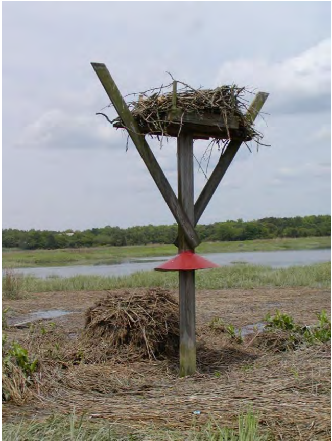
FIGURE 12: SUBTENANT AT FRALINGER NEST- A MUSKRAT HOUSE

Closest River Reach: Steve Clark http://www.cumauriceriver.org/reaches/pg/narratives.cfm?sku=27 Check out reaches #25-28