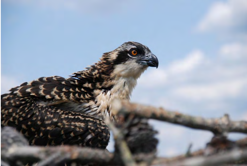
FIGURE 40: HEALTHY OSPREY CHICK