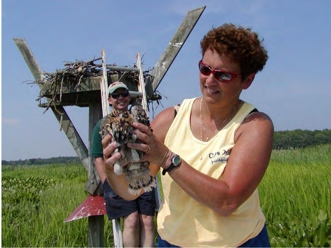
FIGURE 32: MILLVILLE CITY PLANNER HELPS BAND AT PEEK SOUTH

The northern nest was the first to be placed at the Natural Land Trust's Peek Preserve. It was very popular with preserve visitors, and the vastness of the meadow beacons accommodation for another pair of osprey. The refuge manager was supportive. Thus we constructed this nest, erected in 1996. It was an immediate hit with osprey returning from their South American winter break.