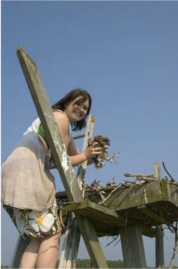
FIGURE 26: TEACHING YOUNG PEOPLE ABOUT BANDING AND OSPREY AT PEEK NEST

In 1995, a few years after the Natural Lands Trust had purchased the Peek property for a preserve site, we erected this nest. Visitors can get a good view of it from the boardwalk on the Preserve. We believe it offers a wonderful opportunity for people to enjoy seeing osprey raise their young. The Peek preserve is accessible from Route 47 one and a half miles south of the junction of Routes 49 & 47.