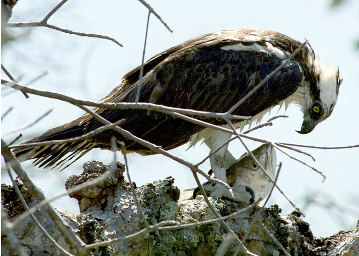
FIGURE 31: OSPREY AND DINNER EXCHANGE A GLANCE

Historically, osprey nested in inland lakes. So, in 1996, we succumbed to the prodding of a few very fervent volunteers from the Centerton Lake area and we erected a nest there. To date, 2008, occasionally an osprey perches there, but no nesting has taken place. We do have some limited reason to be optimistic, in that we placed a nest at Willow Grove Lake in 1997 and it wasn't until 2006 that birds nested there. Centerton isn't very far away and you never know. But everything is about safety and food...so we shall see.