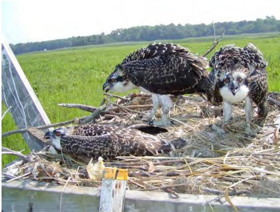
FIGURE 39: A SINGING TRIO AT WOODSTOCK

This nest is named after the adjacent property owner, but I cannot help but think of the Charlie Shultz character from the comics. The gentleman that owns the upland from this nest was given the name Woodstock because he looks like a Woodstock Festival attendee. I don't know the gentleman myself, but a good bit of lore surrounds his image. The one most often repeated is that he is a weekend hermit on the property and is stuck in the 60's. When we conceived of placing the nest there, I was instructed to allow one particular member to inquire about the possibility. The inference was that it wouldn't be safe to approach him if you hadn't been properly introduced. I did meet him at an event many years ago and he had a foreboding appearance. Likely, he is a big pussycat of a guy. And I have no idea about the legitimacy of these stories; as far as I know he could be a Wall St. stockbroker. But it is fun to think that a ferociously independent thinker watches over the nest like a troll watches over a bridge. And frankly, for now, I have chosen to leave it at that, because it is simply more fun that way.