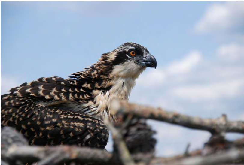
FIGURE 20: JUVENILE OSPREY HAVE ORANGE IRISES; ADULTS HAVE YELLOW