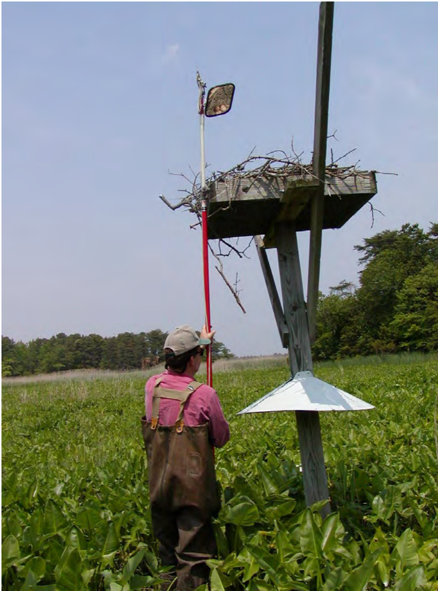
FIGURE 23: BANDER USES MIRROR TO COUNT EGGS AT BREEDEN NEST. THE MIRROR ALLOWS NEST CHECKS TO MOVE MORE SWIFTLY THAN CLIMBING THE LADDER AND IS LESS INVASIVE.