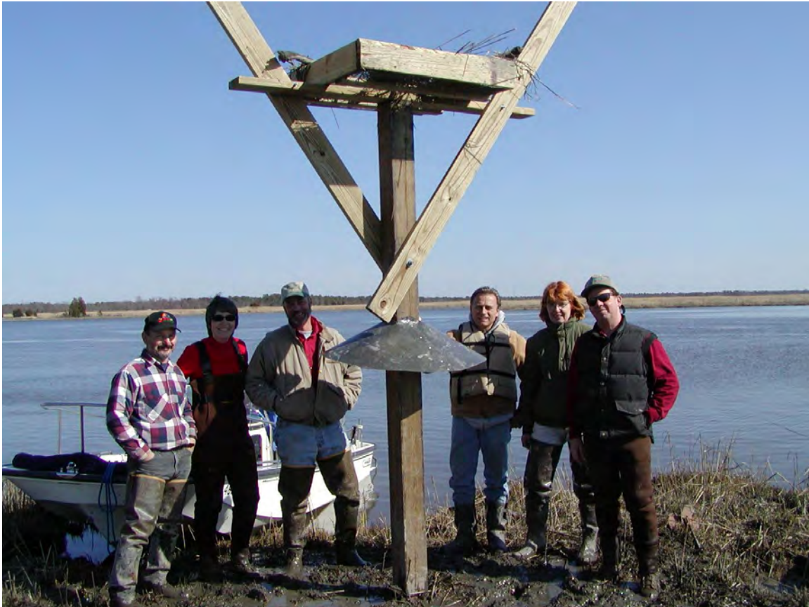
FIGURE 47: CREW JUST FINISHED INSTALLING FISHER / BARBOSE PLATFORM

This nest was sited in 2002. It is named for the closest residence and property owner and their neighbor, who diligently make observations of the osprey. Having stewards of the nests has saved young and protected birds on a number of occasions. Sometimes the reports and observations of our nest stewards have enabled us to rescue birds wrapped in fishing line and avert other types of disasters.