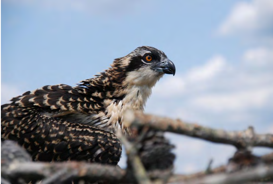
FIGURE 40: HEALTHY OSPREY CHICK

This nest was erected in 1999 not far from the Fralinger nest, the river's original structure. The meadow in which it is located is historically known as the Boudelier farm. This was one of the largest diked meadows on the river and now, like most, is once again flowed by the tide. Rumor has it that bootleg whiskey was made at the Boudelier Farm during prohibition. The Sprengle name comes from the property owner nearest the nesting site at the entrance to Manumuskin Creek.