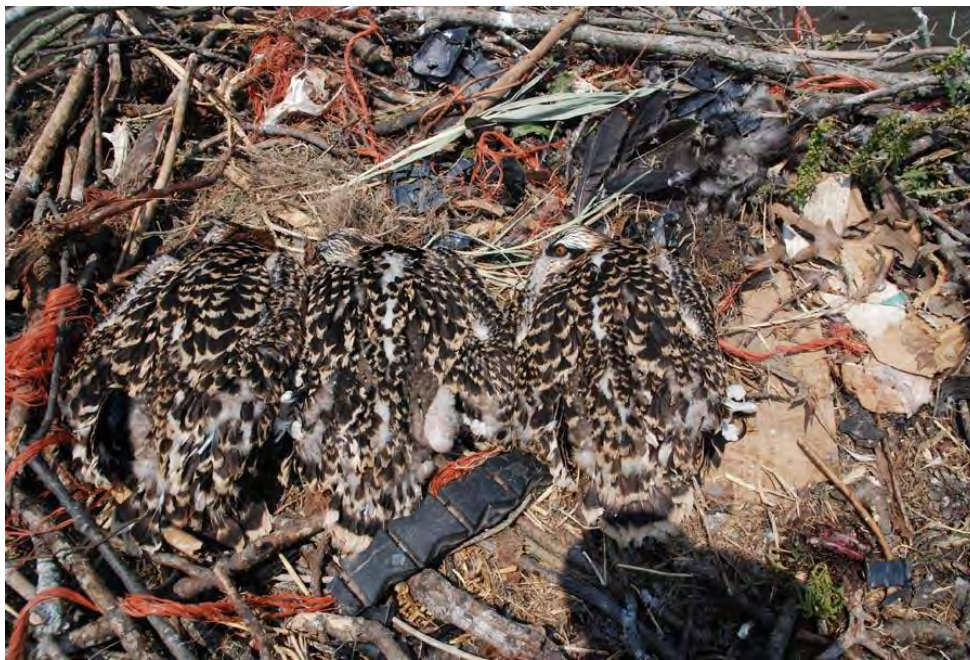
FIGURE 13: FICCAGLIA NEST FESTOONED WITH ORANGE ROPE, PLASTIC, CARDBOARD, TIRE TREAD, PLASTIC PLANT CONTAINERS

Let's move on to the personality of the birds in this nest. You have heard of a junkyard dog? Well, this bird has it all over any local junker. Besides the usual sticks and grasses, its nest is filled with primarily two items: orange nylon rope and clear plastic - so much so that we have, on occasion, had to cut chicks free from the bondage of the line. We don't know where the orange rope comes from but we have written it up in the local paper to try to get to the bottom of this. The mystery remains unsolved. The bird is also a "builder bird," making an unusually large nest.