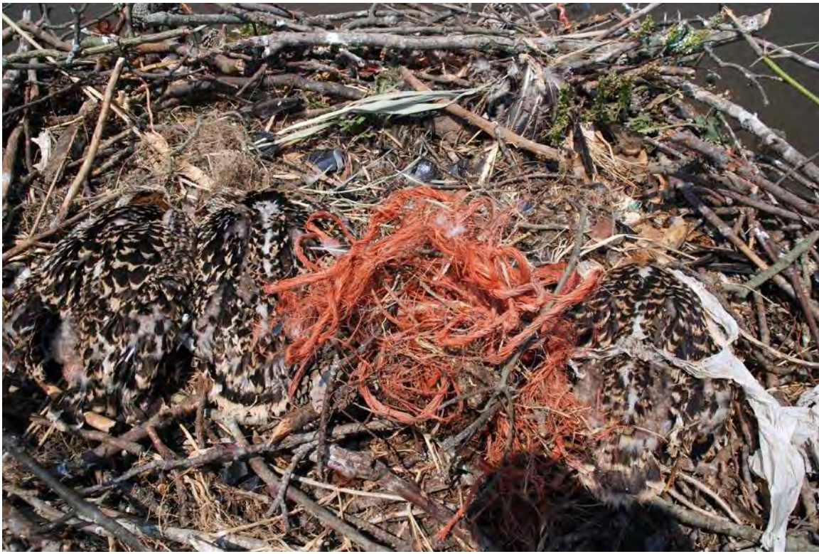
FIGURE 14: PORTION OF ORANGE ROPE REMOVED FROM NEST