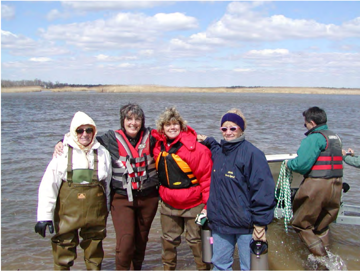
FIGURE 65: WOMEN VOLUNTEERS ENJOY CAMARADERIE