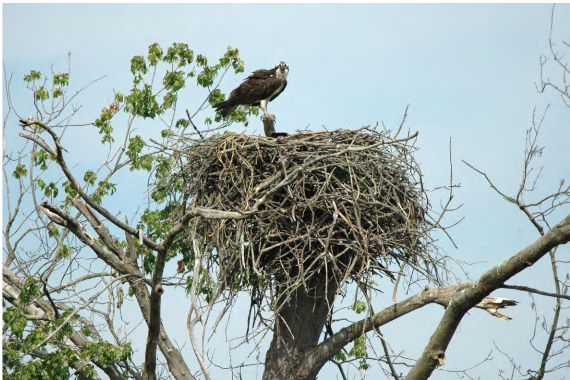
FIGURE 54: THE NATURAL NEST FELL IN THE 2008-09 WINTER; SOME BIRDS JUST OVERBUILD.

This particular stretch of river is frequented by eagles and aerial fights are a common occurrence; so much so, that a group of birders saw an argument that occurred when the osprey was put in its place and bore the cuts from the ensuing battle. Osprey/eagle arguments are extremely interesting. Osprey use their smaller, more agile wings, with their greater maneuverability, to their advantage, while the eagle uses strategy and bulk. The match of wills makes for a very action-packed test. The eagle seeks to gain higher elevations to provide the speed it can gain in a stoop, or swift downward descent.