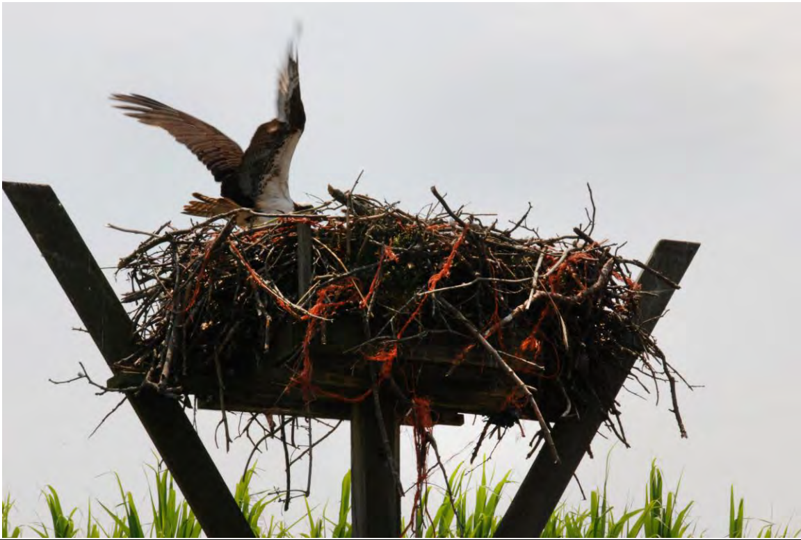
FIGURE 15: ORANGE ROPE HANGS DOWN LIKE STREAMERS FROM NEST