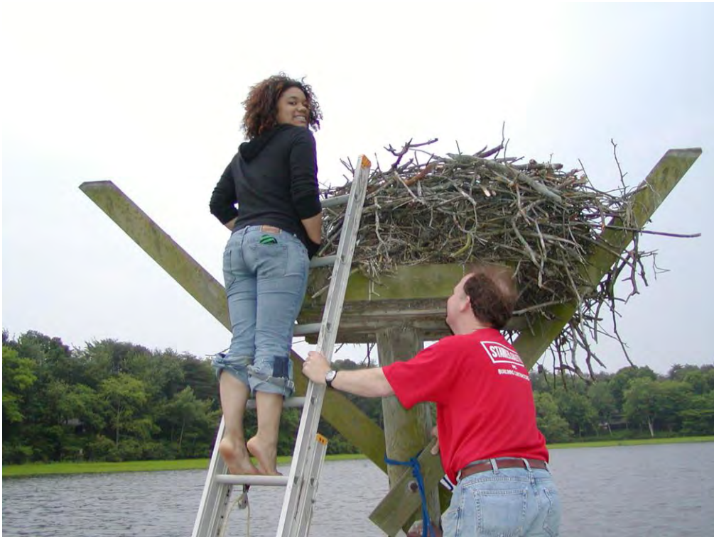
FIGURE 1: TEENAGER GETS TO SEE CHICKS

This pair over many years has been one of the earliest nesters and was extremely productive. It was the start of a very large and successful osprey nesting colony project in which nearly 150+ volunteers have participated.