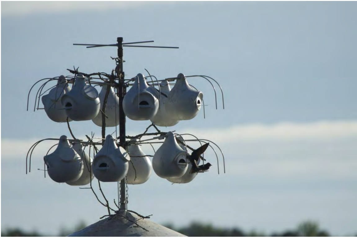
FIGURE 60: STICKS LACE PURPLE MARTIN GOURDS.