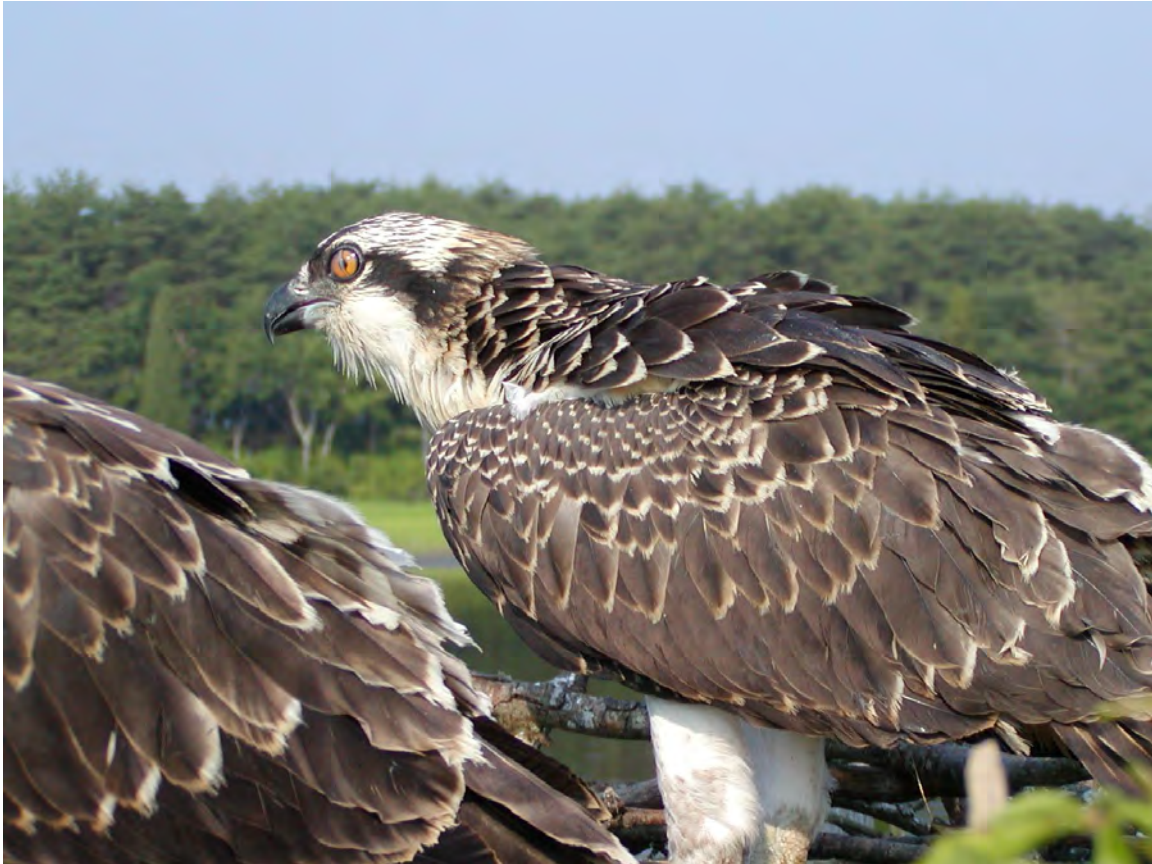
FIGURE 66: NOTE SECOND EYE LID, WHICH IS TRANSPARENT AND PROTECTS EYE (NICATATING MEMBRANE)

This nest was built by a pair of ospreys on top of a dolphin (a cluster of pilings strapped together) in front of what was once the Whibco shipyard. In order to band in this nest we do a somewhat harrowing ascent. We strap the stern of the boat to the pilings and climb a ladder. When we arrive at the foot of the nest, I envision that we should draw straws to see who will make the steep climb.