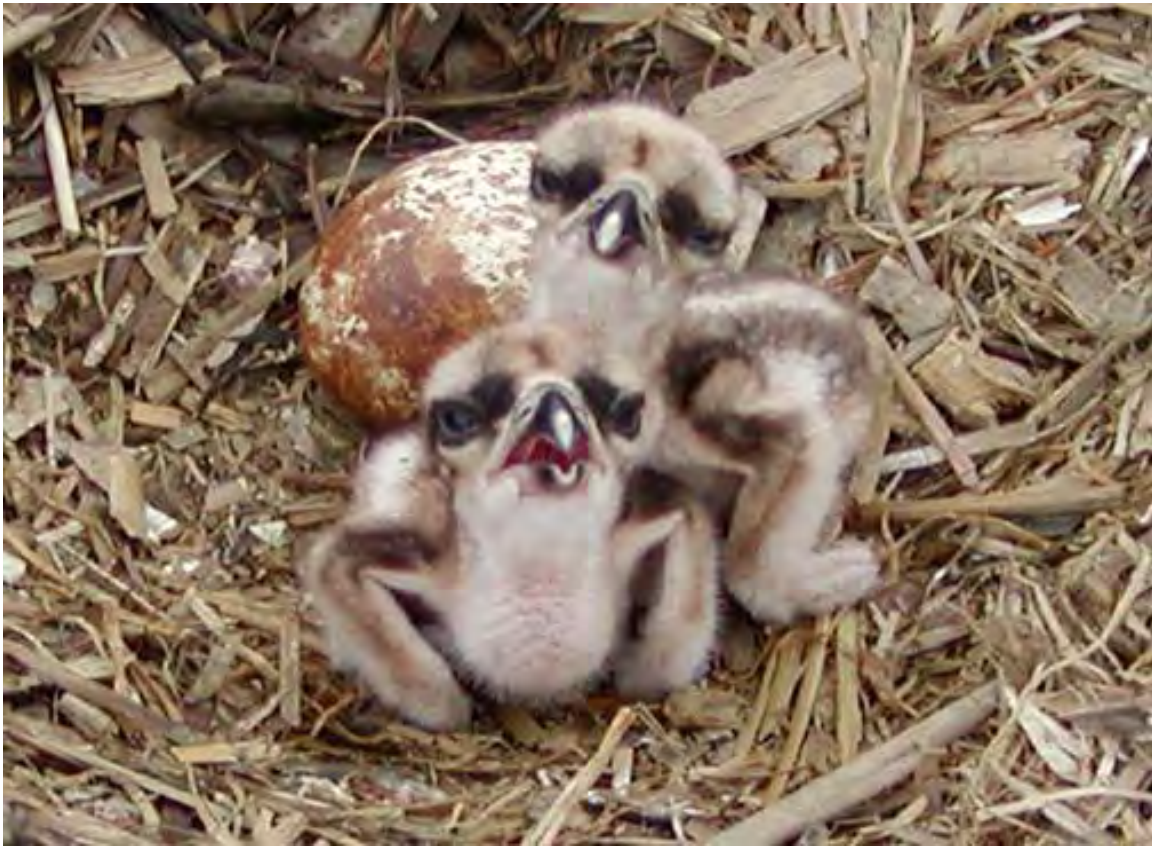
FIGURE 2: JUST A FEW DAYS OLD