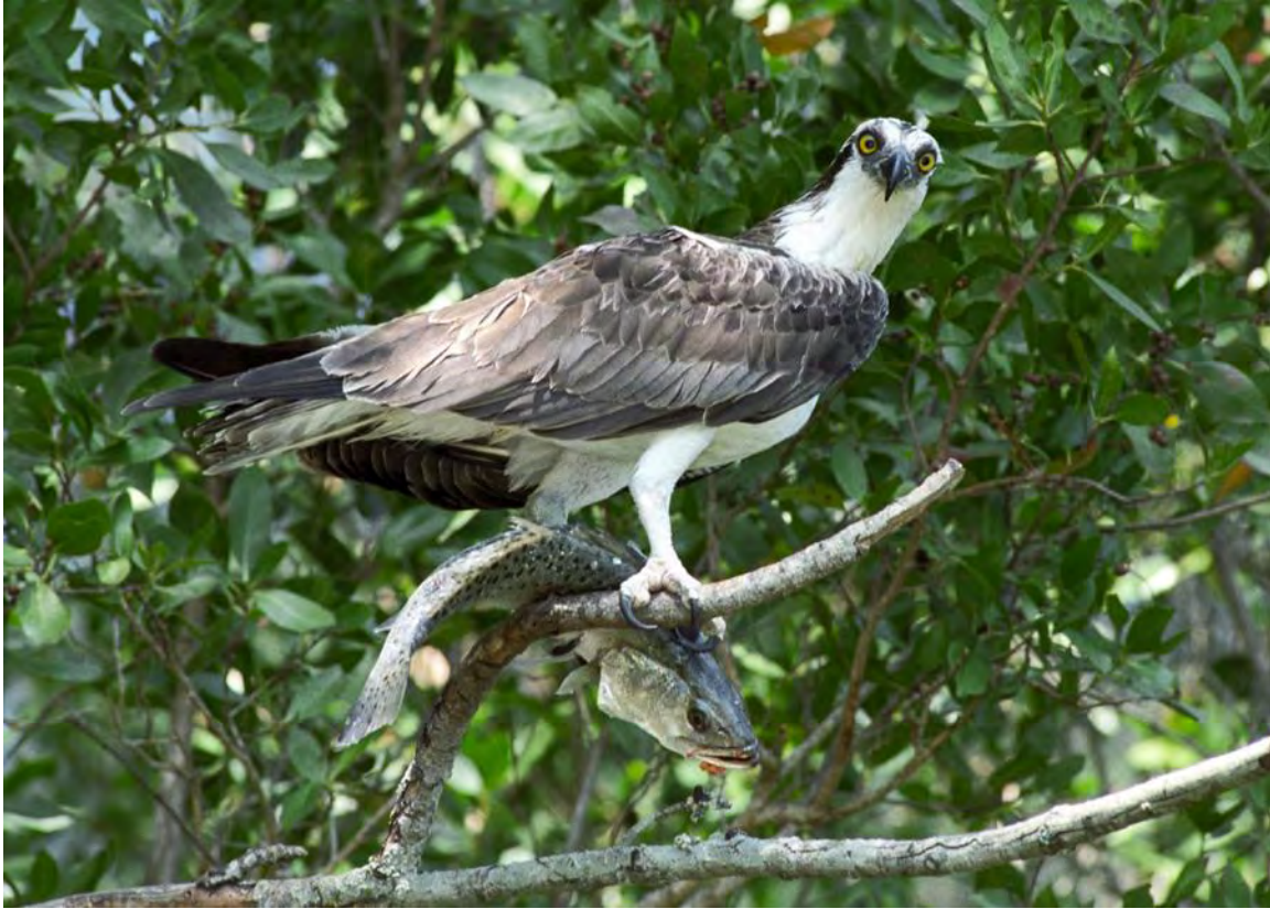
FIGURE 44: DINNER

This nest was put up to discourage a pair of nesting ospreys from using a duck blind. The duck blind was very susceptible to predation and likely, the duck hunters didn't enjoy the mess each fall. It was erected in 2001 and used that same year. We have found that nests have been extremely successful when we use the bird's own attempts as clues to where they want nests.