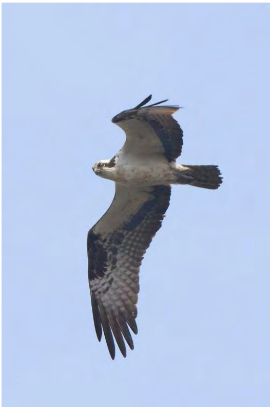
FIGURE 37: OSPREY AT WILLOW GROVE

We left the Dorchester Shipyard site and headed to Willow Grove Lake. We took a nice lazy paddle in a canoe to the nesting site, totally secure in what we were about, only to find that I had worn the hard hat for the wrong osprey. But isn't that often the way life seems to unfold? We know about being prepared - we simply are a little off base on various occasions.