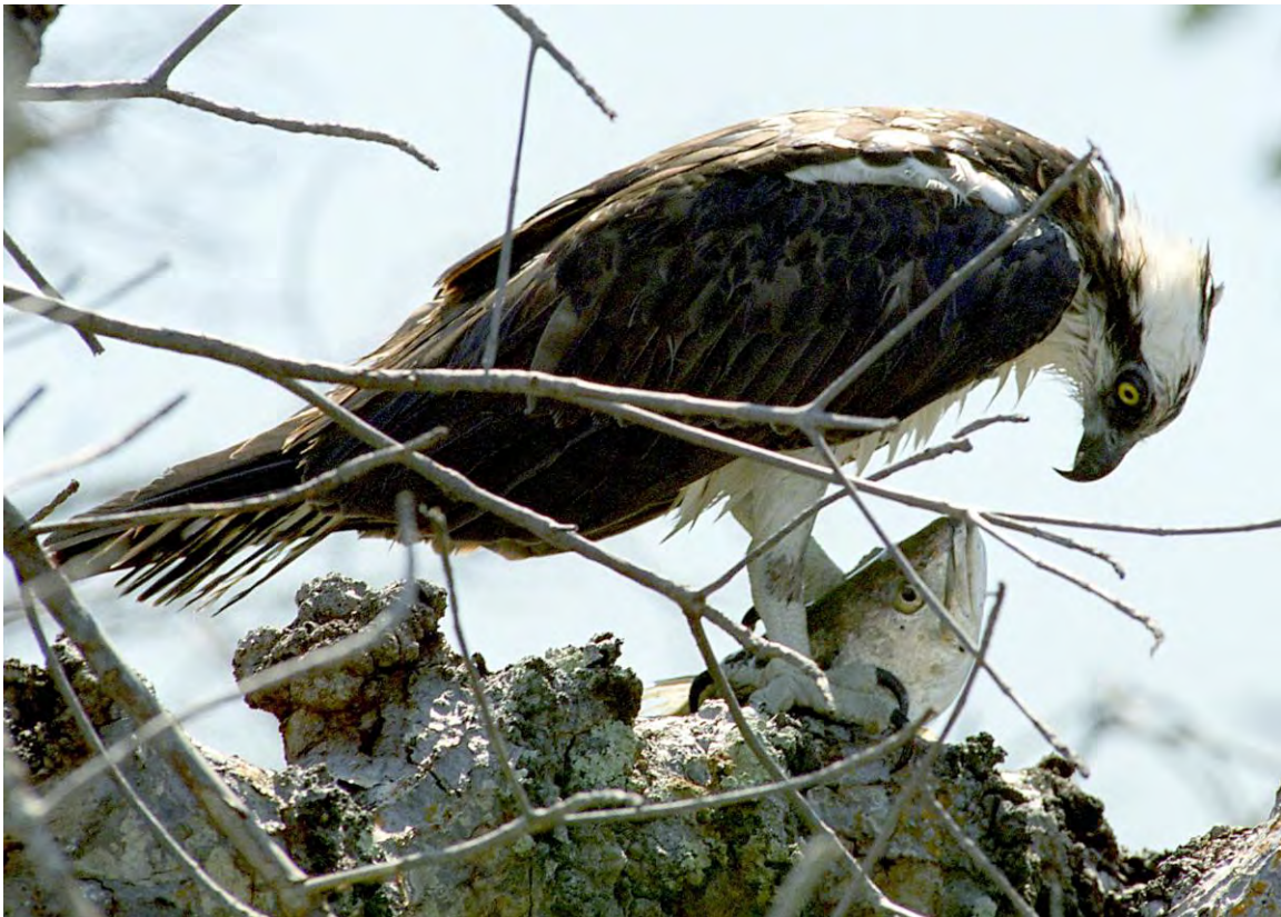
FIGURE 31: OSPREY AND DINNER EXCHANGE A GLANCE

Historically, osprey nested in inland lakes. So, in 1996, we succumbed to the prodding of a few very fervent volunteers from the Centerton Lake area and we erected a nest there. To date, 2008, occasionally an osprey perches there, but no nesting has taken place. We do have some limited reason to be optimistic, in that we placed a nest at Willow Grove Lake in 1997 and it wasn't until 2006 that birds nested there. Centerton isn't very far away and you never know. But everything is about safety and food...so we shall see.