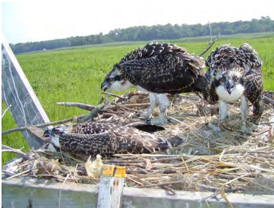
FIGURE 39: A SINGING TRIO AT WOODSTOCK

This nest is named after the adjacent property owner, but I cannot help but think of the Charlie Shultz character from the comics. The gentleman that owns the upland from this nest was given the name Woodstock because he looks like a Woodstock Festival attendee. I don't know the gentleman myself, but a good bit of lore surrounds his image. The one most often repeated is that he is a weekend hermit on the property and is stuck in the 60's. When we conceived of placing the nest there, I was instructed to allow one particular member to inquire about the possibility. The inference was that it wouldn't be safe to approach him if you hadn't been properly introduced. I did meet him at an event many years ago and he had a foreboding appearance. Likely, he is a big pussycat of a guy. And I have no idea about the legitimacy of these stories; as far as I know he could be a Wall St. stockbroker. But it is fun to think that a ferociously independent thinker watches over the nest like a troll watches over a bridge. And frankly, for now, I have chosen to leave it at that, because it is simply more fun that way.