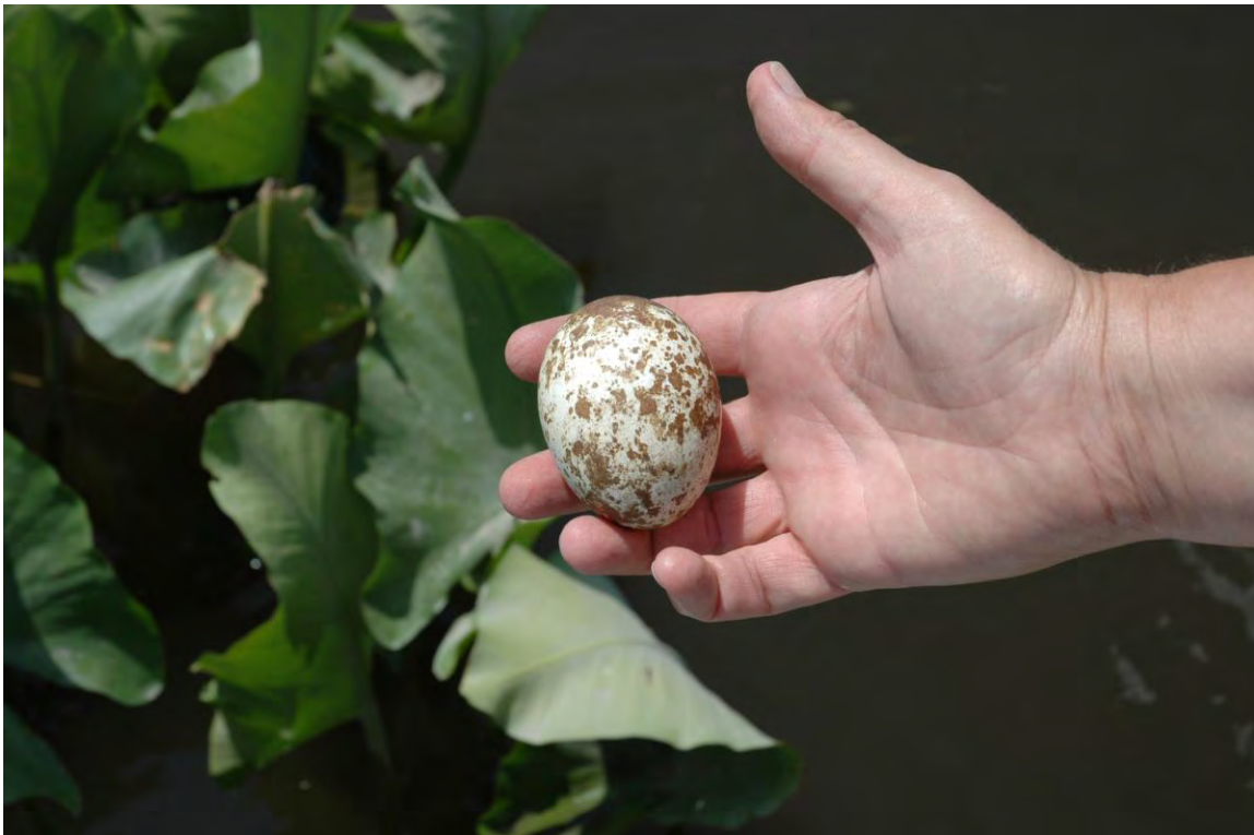
FIGURE 46: AUTHOR SHOWS OSPREY EGG; THIS EGG WAS UNSUCCESSFUL.

The nest does not bring to mind any truly unusual stories but it recalls some rather usual stories. We have been erecting osprey nests since 1985 and we have put up about 80 platforms and made a couple of dozen for other organizations to erect. It is very difficult not to have a few items end up in the drink. Apparently, I am the queen of the butterfingers. At this nest, I lost a garden claw used for cleaning off the nest for the coming season. The water was waist high. Months later, we returned at a lower tide and naturally, I found the tool by stepping on it. Somewhere out there is a catfish with a closet filled with wrenches, sunglasses, prescription glasses, a cordless drill, a camera and it's even making calls on my cell phone. Hey, look, who was I to deny that poor whiskered beast?