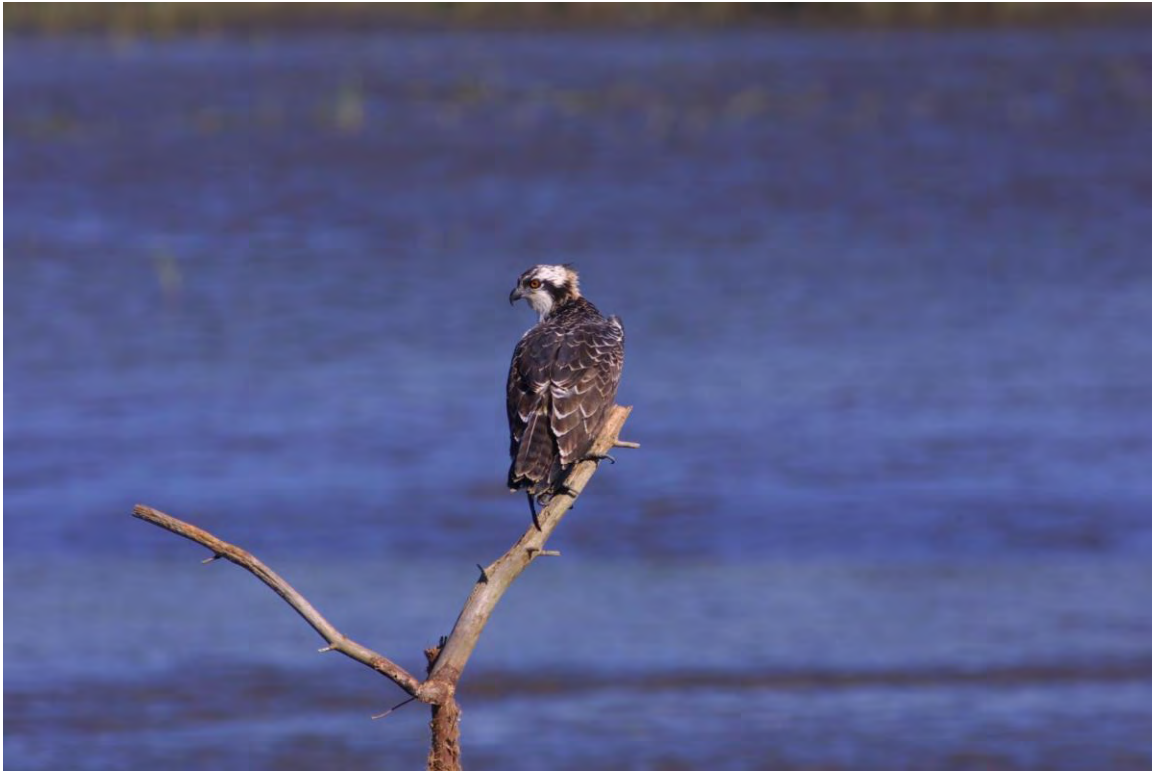
FIGURE 51: NEWLY FLEDGED OSPREY