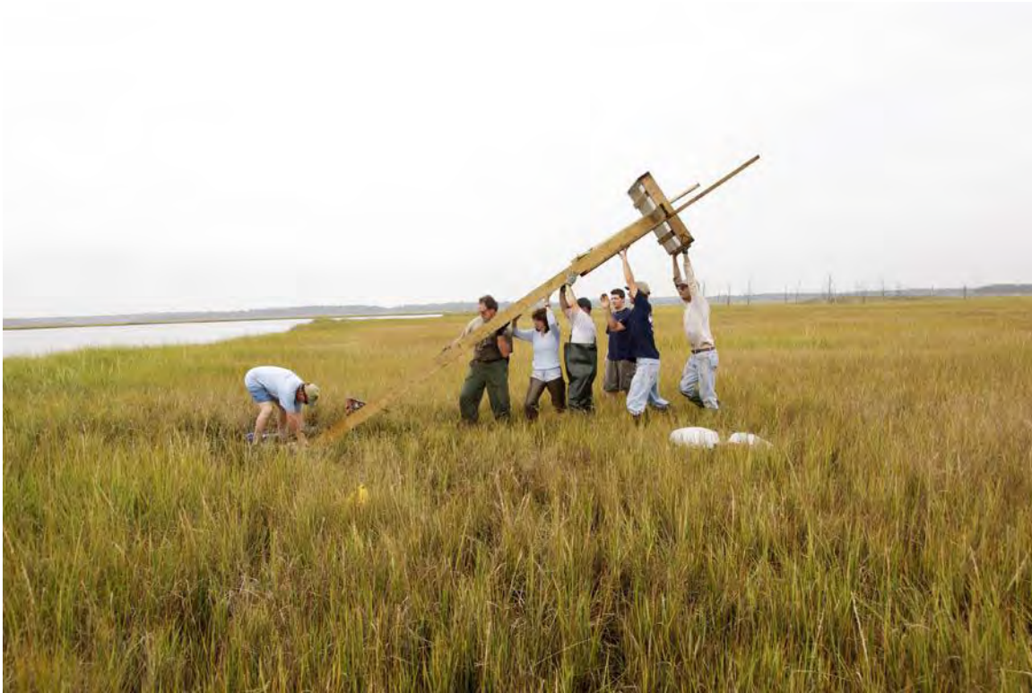
FIGURE 70: CREW SHOWS PROPER WAY TO LIFT NEST INTO PLACE- TALLEST PERSON ON FAR END

Put up the fall of '08, nothing to report yet.