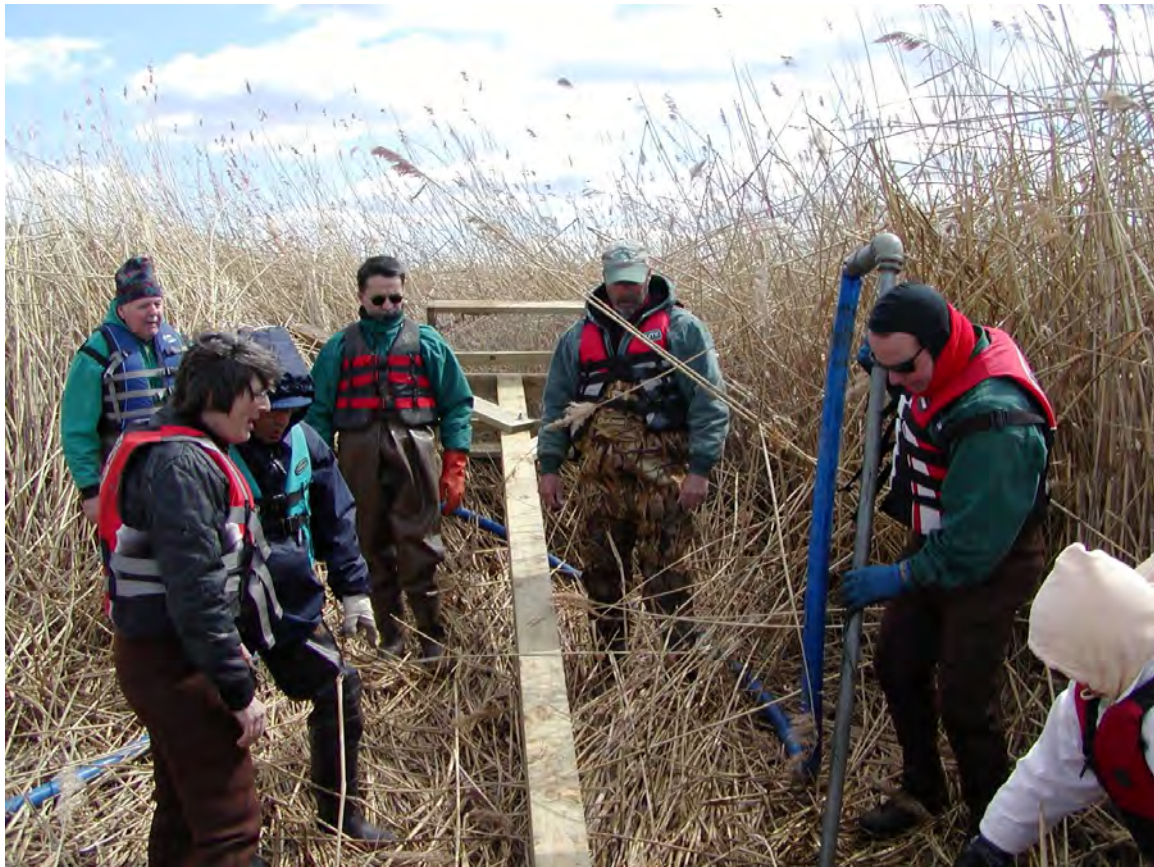
FIGURE 49: CREW WATCHES AS HOLE IS PUMPED FOR THE POLE FOR ANDRUS NEST

This nest is placed in such a phragmites-infested area that it has a very poor viewscape. A pair of birds persists there nevertheless, but that is unusual. Poor viewsapes normally mean no takers. Thus far, the birds have shown immaturity in that they raise their brood late like first-year breeders. By the second year of nesting, pairs normally catch up to the schedule of the neighboring birds. Dr. Alan Poole, one of the world's leading authorities on osprey, believes that most late broods don't survive migration. We had one other nest that took about four seasons to catch on and now they are one of the earlier nesters. So time will tell what schedule these birds ultimately adopt.