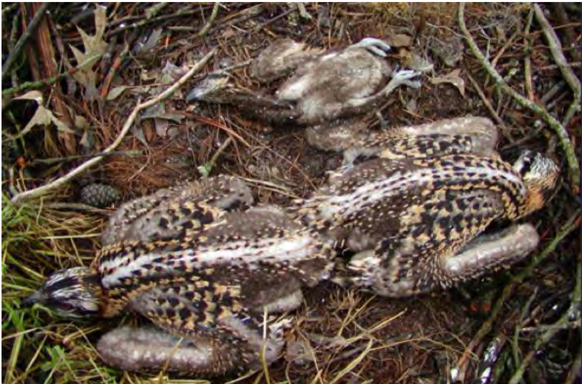
FIGURE 6: THREE CHICKS ABOUT THE SAME AGE, BUT ONE IS STARVED TO DEATH, FIRST LAID IS FIRST FED