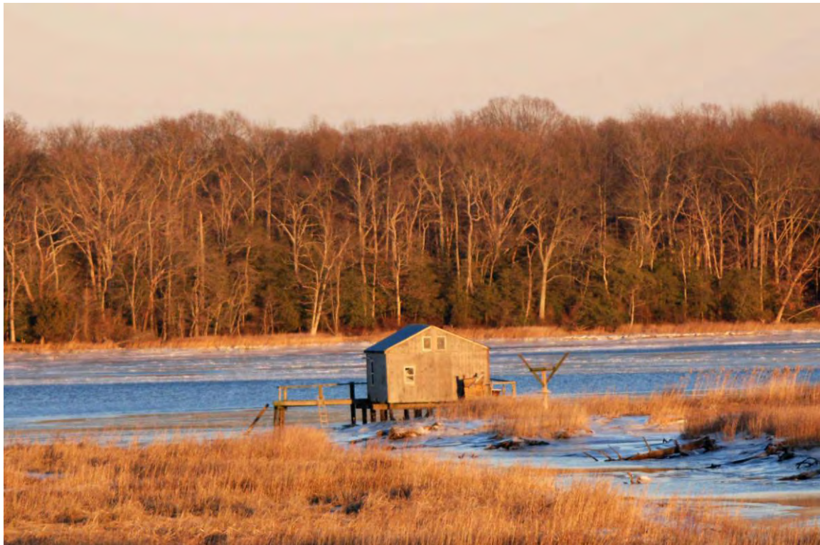
FIGURE 48: LOOKING UP ACORN DITCH TO THE OLD SHACK NEST

We had a small crew in March of 2003. It was a miserable cold day and the day's events are a clear testament to the dedication of our volunteers. Normally a strong crewmember will do what we call "foot the nest." After washing in a hole, one person keeps the end of it from slipping past the entrance of the hole when the platform is hoisted up. This task was left to me and is not easily forgotten. The water was about knee deep which meant my shoulders were in the water and my face was getting plenty wet. When I lifted my arms out of the water, the sheen of water on my water jacket turned to ice and when I bent my arms, the ice cracked and fell like a thin sheet of glass. Everyone including myself found this humorous. But I will tell you that when we finally returned to the warmth of the house it was a welcomed treat.