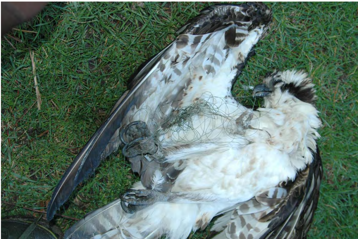
FIGURE 34: MONOFILAMENT ENTANGLED IN TALONS