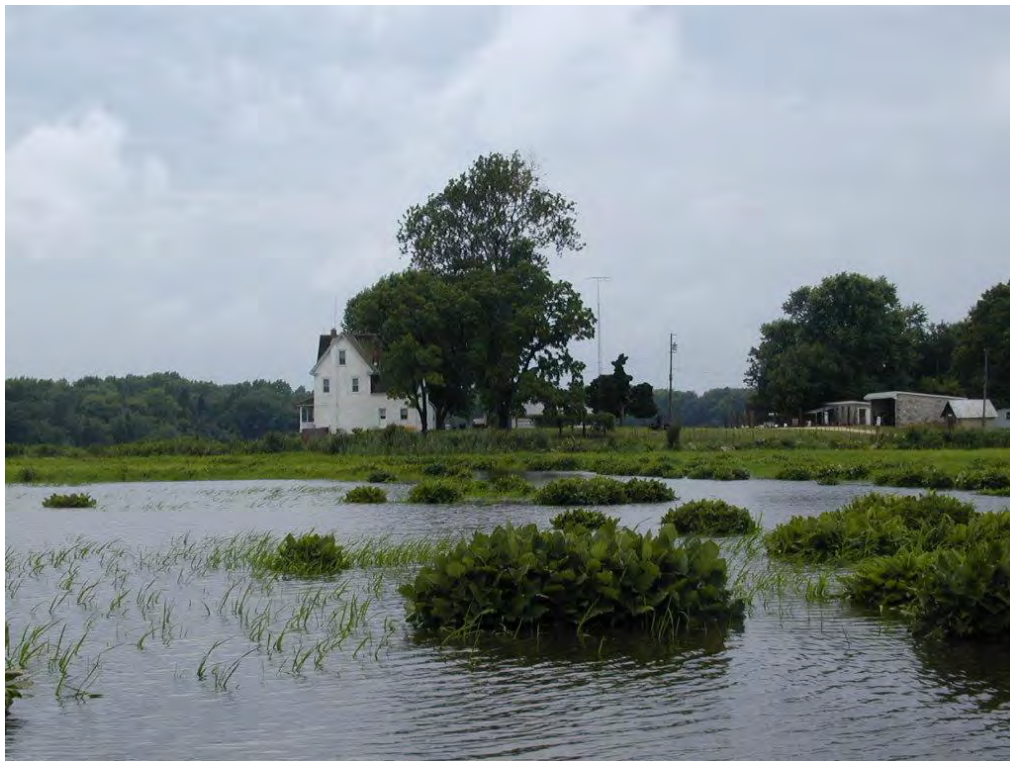
FIGURE 3: VIEW OF BURCHAM FARM FROM BURCHAM NEST

Originally, we used 24 6'x6' poles for nesting platforms. The height, we felt, increased the sight distance of the birds. In order to erect a nest we had to use scaffolding. We used to use an old pallet hung off the edge of the pole, making the pole less balanced and unusually heavy. The combination of imbalanced, long, and weighty made the pole very difficult to manage. Added to these difficulties, we put the nest in a very muddy bottom and 4' of water. The inevitable happened on the day we put it up: the structure got away from us and took out a small pram we were using for the pump, and hit two spectators. Fortunately, no one was hurt and the nest proved successful. Since then we have changed to 16' poles and use a well-balanced structure. Ten feet above the marsh plain is sufficient for success and makes maintenance and banding much more efficient. Also, we try to find marsh areas where we might have the best footing. In our river basin, this is not an easy task. At times, we have laid a couple of sheets of plywood so we don't sink in the muck above our knees.