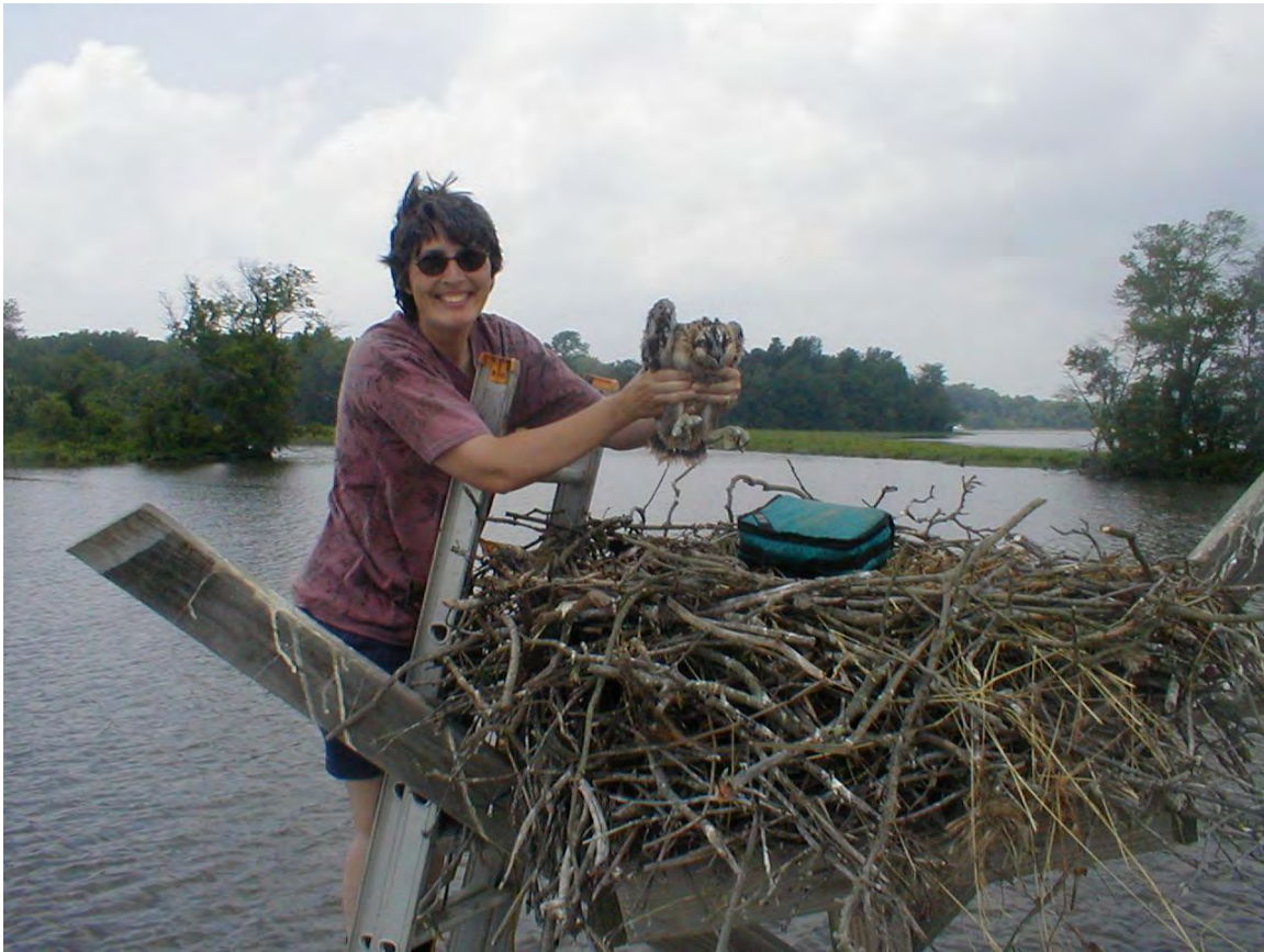
FIGURE 35: AUTHOR HOLDS UP CHICK FOR PHOTO OP

Closest River Reach: Some Buckshutem Creek