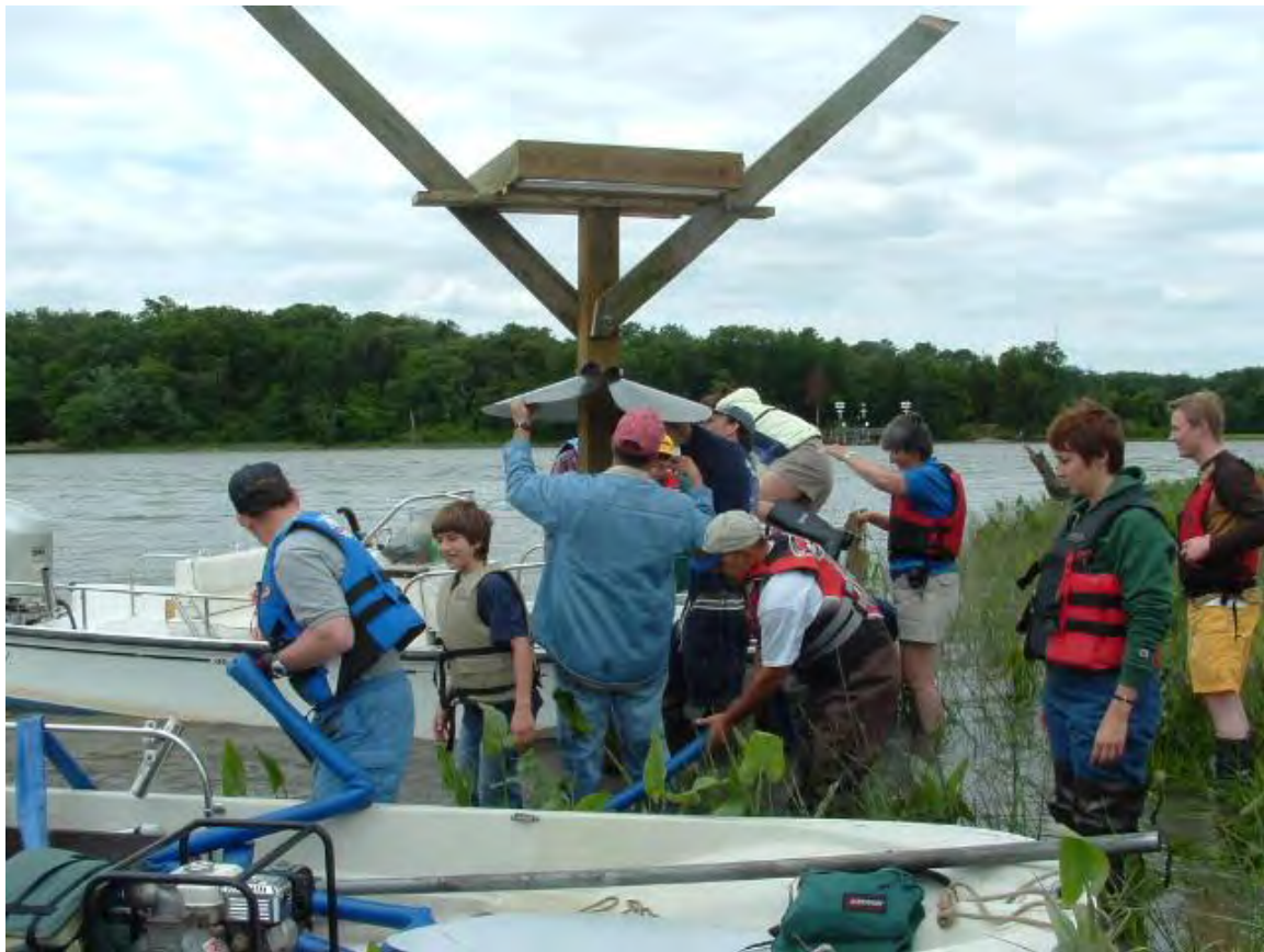
FIGURE 58: CREW PUTS PREDATOR GUARD ON CHAOS; NOTE PURPLE MARTIN HOUSES ON OPPOSITE SIDE OF RIVER.

The name of this nest comes from the chaos an osprey caused before we accommodated him with a brand new home. This is one of those nests that the birds told us they needed, by persistently trying to place sticks on top of a bank of purple martin gourds. In fact, we would remove the sticks and he would be right back at it the next day. The crosspieces atop the martin gourds really did not support the sticks, and the martins did not think much of the building process either. The entire area was truly in chaos. We normally travel the river looking for opportunities like this to know where to place the next platform. Build it and they will come is sometimes effective, but build it where they are – REALLY works best! In this case, the birds came to us, for the martin house is on the end of our dock. So we decided to place a platform directly across the river. We took bets on how many minutes it would take after we left the construction site for the birds to begin using the nest. And those who guessed less than 10 were the winners. Yes, build it where they ARE or want to be. The only thing these birds did not do was knock on the front door with floor plans.