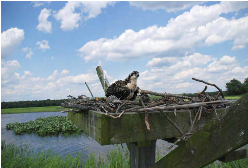
FIGURE 42: BIRD'S EYE VIEW FROM OWL COVE NEST