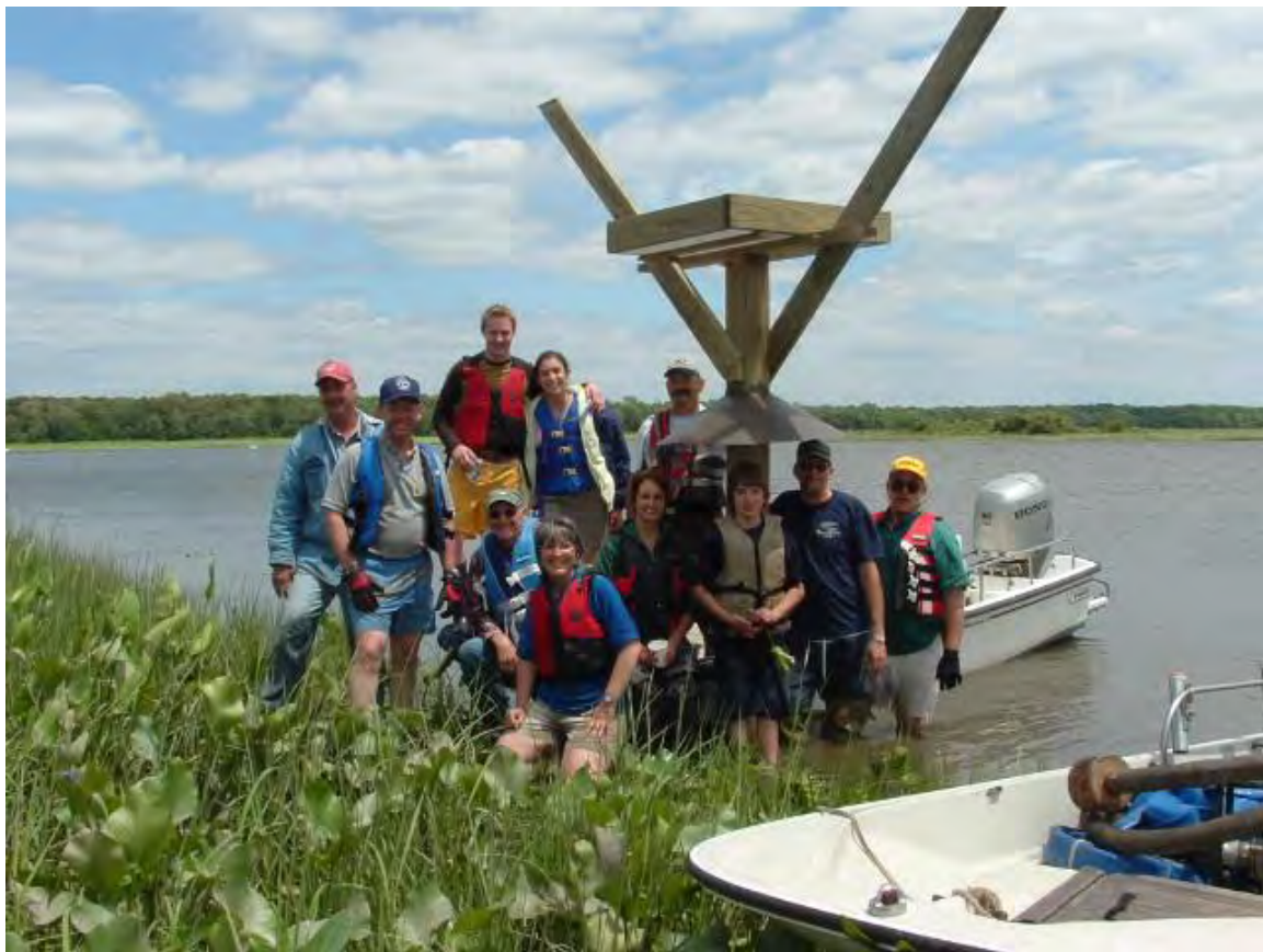
FIGURE 62: CREW AT BASE OF CHUTE NEST JUST AFTER CONSTRUCTION.

The name Chute is the name of the closest reach. The Keys Sand Plant existed on this stretch of the river in the late 1880s and we suspect the “chute” refers to the mechanism that loaded material onto vessels at this site.