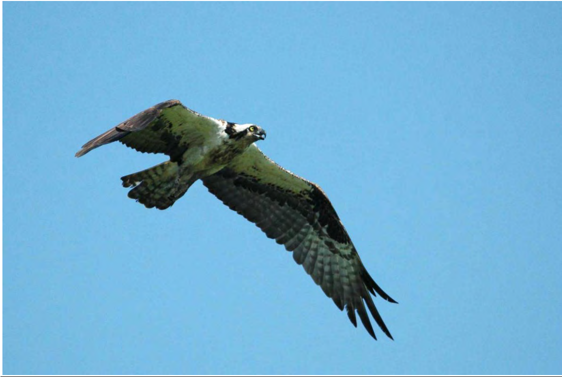
FIGURE 52: NOTICE YELLOW EYE ON MATURE OSPREY; HEAVY FLECKS ON CHEST WOULD INDICATE A FEMALE.

This nest is named for the family who lives closest to the platform. We have been trying to lure a pair of birds that just does not seem able to get it right. Unfortunately, thanks to phragmites, I don't think we got it right either. This particular pair has not been successful on any number of structures that they have tried in about a 300' radius of the platform provided. We are hoping to get some kind of synergy that works for the birds, as they are continually ill fated in their nesting attempts. We'll see.