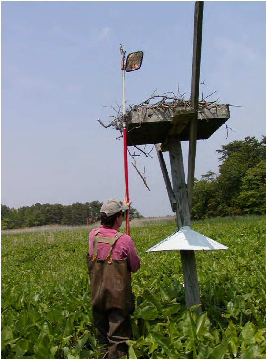
FIGURE 23: BANDER USES MIRROR TO COUNT EGGS AT BREEDEN NEST. THE MIRROR ALLOWS NEST CHECKS TO MOVE MORE SWIFTLY THAN CLIMBING THE LADDER AND IS LESS INVASIVE.