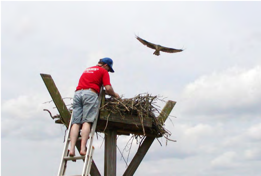
FIGURE 11: OSPREY FLIES OVERHEAD AS THE VOLUNTEER CHECKS THE NEST