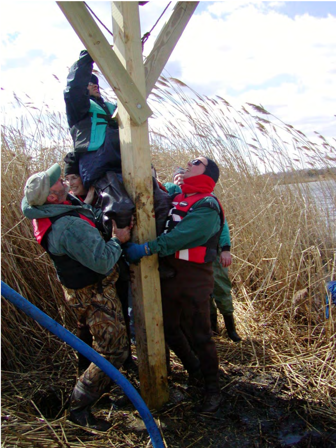
FIGURE 50: VOLUNTEER HANGS FROM NEST TO FURTHER SINK POLE