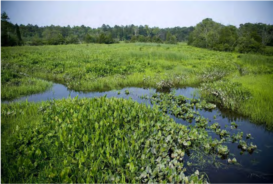
FIGURE 8: VIEW FROM KIRBY PLATFORM