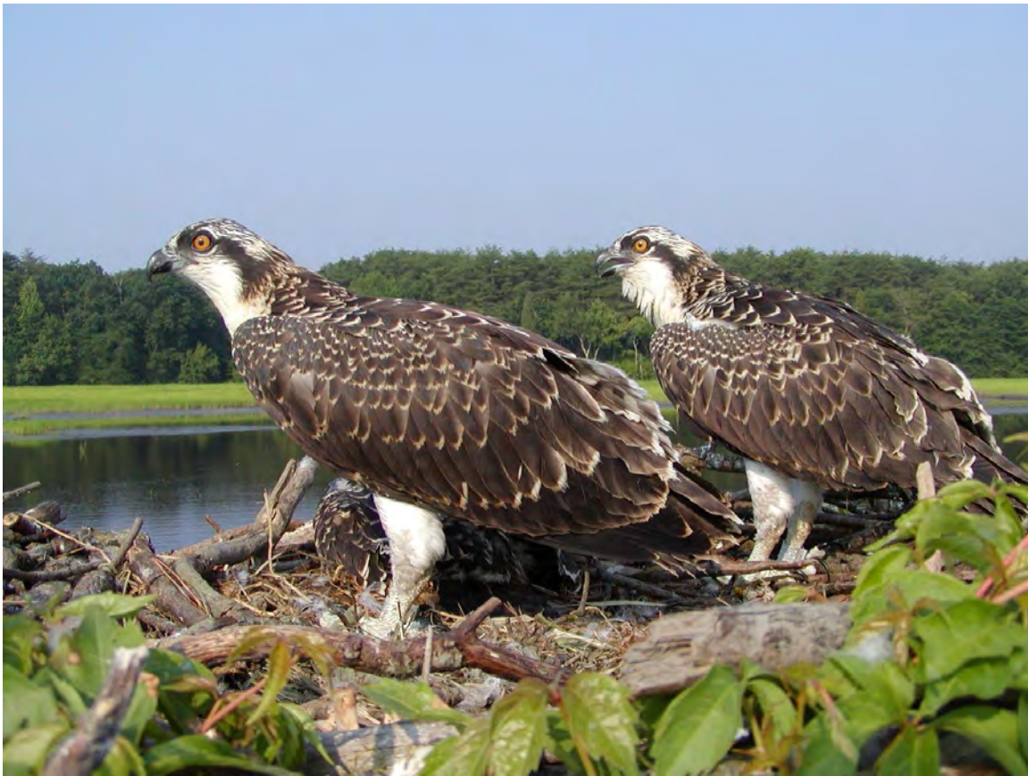
FIGURE 5: CHICKS JUST BEFORE FLEDGING, ABOUT 8 WEEKS OLD

The Johnson nest, like many, is named for the folks whose property the nest is erected on or who are the observers and stewards; in this case, both are true. The nest lies adjacent to Acorn Gut. This pair of birds is always the first to set up shop and get down to the business of raising their family. Normally the female will be on eggs before the end of March. On Mother's day, we normally make our first egg checks and we use the activity at this nest as a guideline for the beginning of each maintenance task. Twice we have made the error at this nest of coming to band too late, primarily because the birds start so early. In both instances, a chick prematurely jumped ship. This means having to recover the chick and place it back in the nest. It is not a lot of fun for the bird or the banders. We like to think we are wiser and will avoid this issue by banding earlier. So far so good.