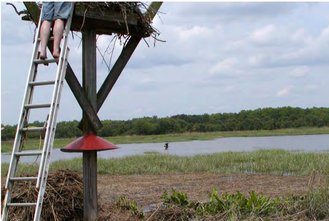
FIGURE 10: NOTE OSPREY BEATING WATER