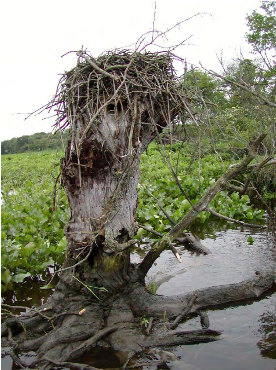
FIGURE 55: THIS NEST, BUILT ON THE SAME DIKE, WAS SO CLOSE TO THE GROUND THAT PREDATORS HAD EASY PICKINGS.