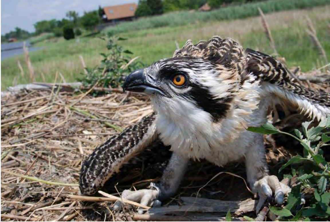
FIGURE 22: VIEW OF VANAMAN HOUSE FROM VANAMAN NEST