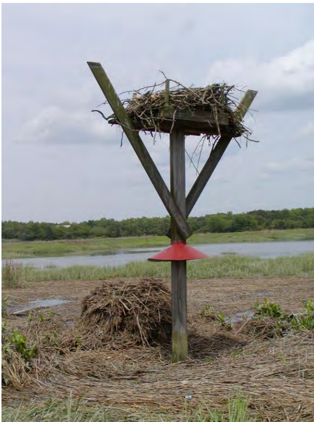
FIGURE 12: SUBTENANT AT FRALINGER NEST- A MUSKRAT HOUSE