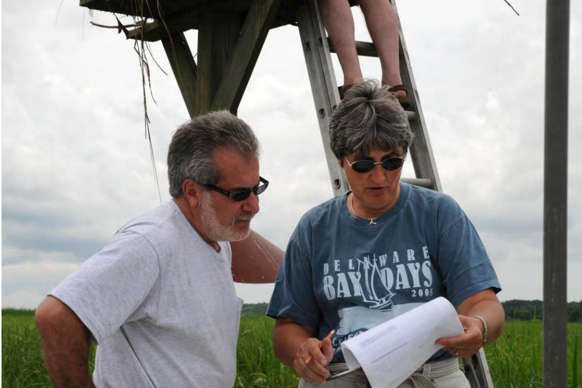
FIGURE 27: AUTHOR SCRIBES BANDING NUMBERS AS REPORTED BY BANDER ABOVE.

The Strauss family properties abut the shore near this nest. It was one of four platforms erected in 1995. It lies on a river reach referred to as Bone Yard, named for the old Swedish Cemetery (now gone) that was on the nearby riverbank. It is said that the bones of bodies were exposed on the face of the bluff as the banks receded.