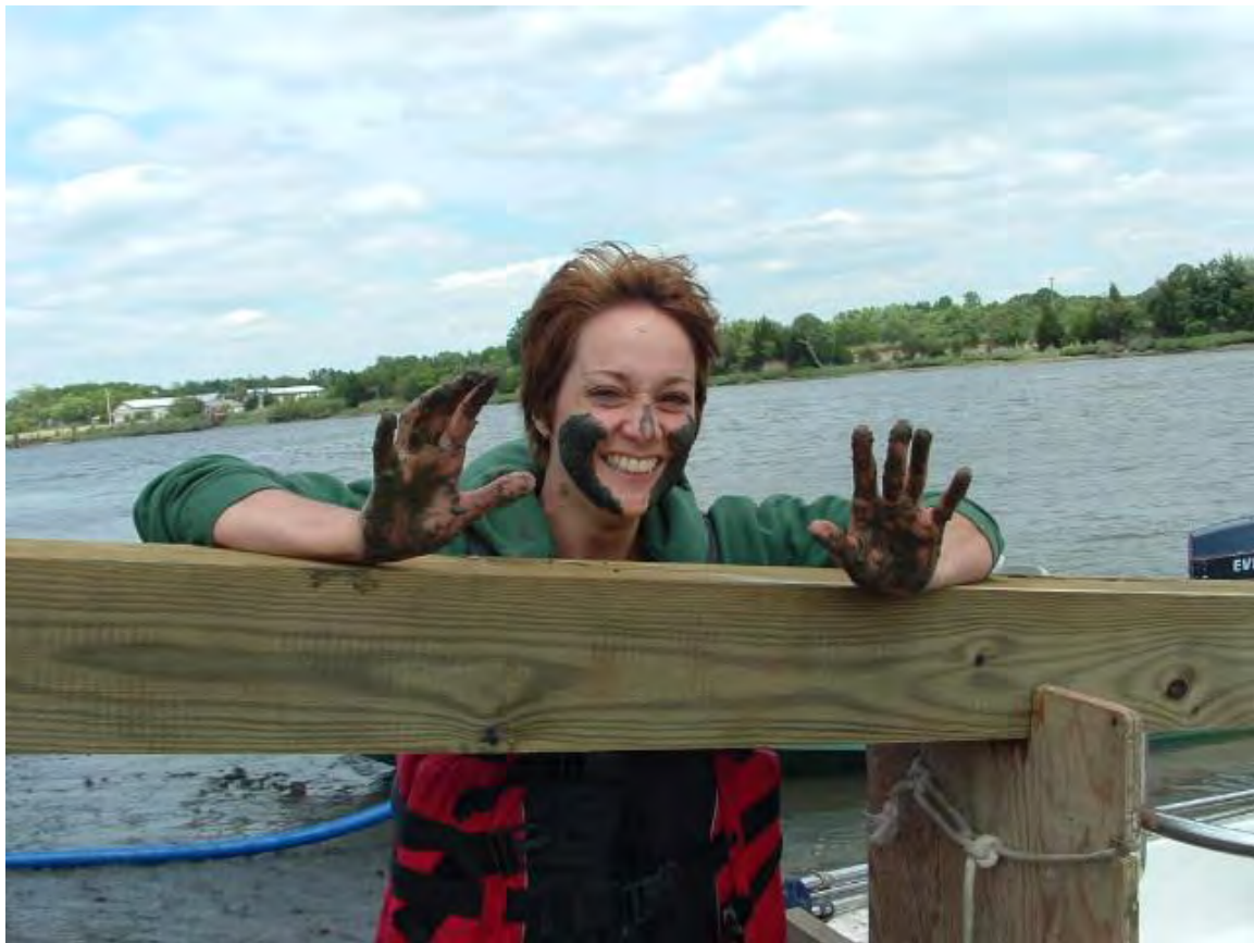
FIGURE 64: CITIZENS UNITED ASSOCIATE DIRECTOR HAS A LITTLE FUN WITH A MUD FACIAL

I'm not sure why but it seems as though the women take the mud much less seriously than the men and find it especially hilarious to be stuck in it. And we do appear to feel an obligation to help those in need, sort of Florence Nightingales of the muck. One day in particular I think about three of the more curvaceous among us were stuck together and were of no assistance except to provide the levity for those who actually hoisted the nest. I'm not sure how we finally escaped the knee-high "blue mud" predicament, but I clearly remember us laughing so hard that our sides hurt.