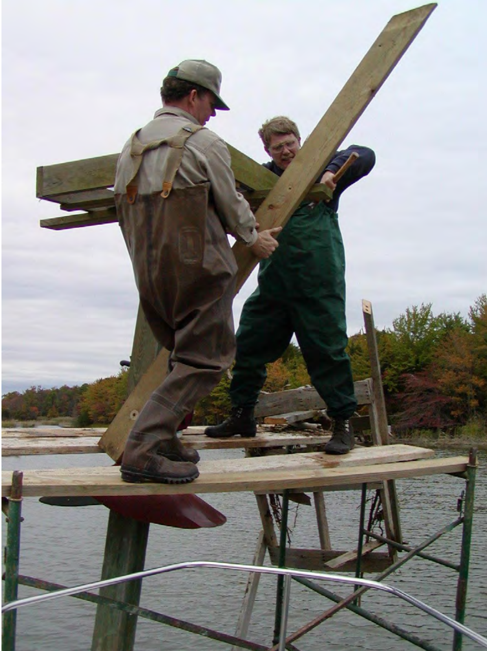
FIGURE 4: SCAFFOLD IS USED TO AFFIX A NEW PLATFORM ON AN EXISTING POLE