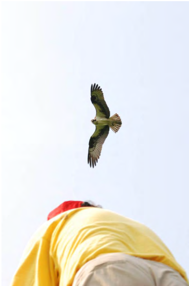
FIGURE 24: NOVAKOWSKI BIRD GIVES BANDER GRIEF- GOOD MOM!

When a bird, year after year, displays a particular behavior, and on a nest visit I don't see the behavior anymore, I feel a little sad, because I suspect that one member of the pair has perished.