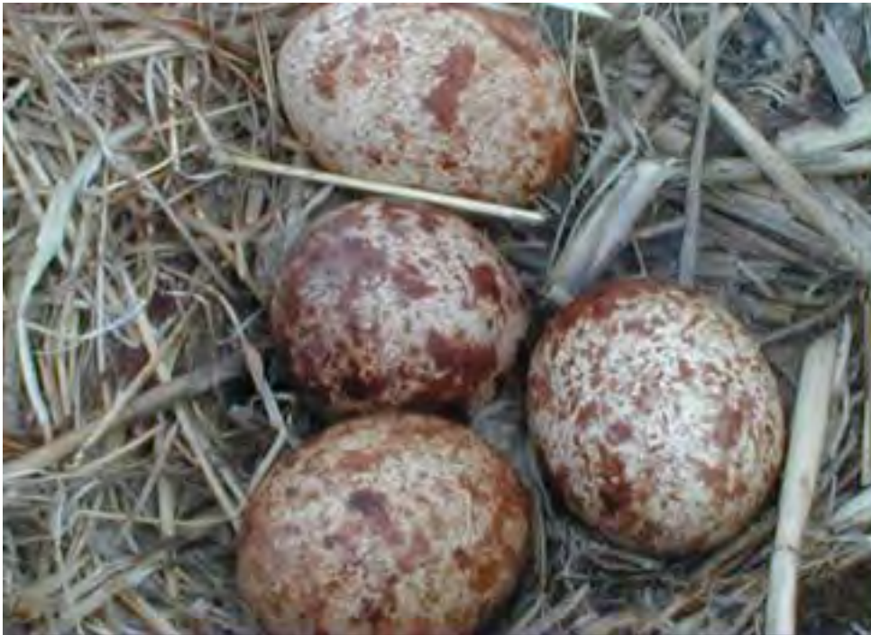
FIGURE 19: FOUR EGGS IS VERY UNUSUAL; OF 279 CLUTCHES BANDED, ONLY 15 HAVE HAD FOUR EGGS

There is one little twist of fate that is worthy of note this pair is one of only three pair that have produced four chicks. To give you an idea how extraordinary this occurrence is of 279 clutches since 1994 only 15 have had four eggs and only three actually raised four chicks. And I'm thinking possibly the mother is very grateful that we did not call the nest 5 Star.