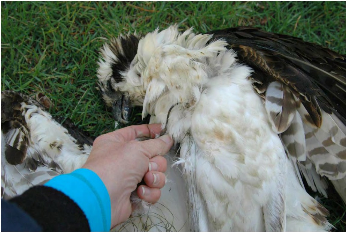
FIGURE 33: FISHING HOOK EMBEDDED IN CHEST