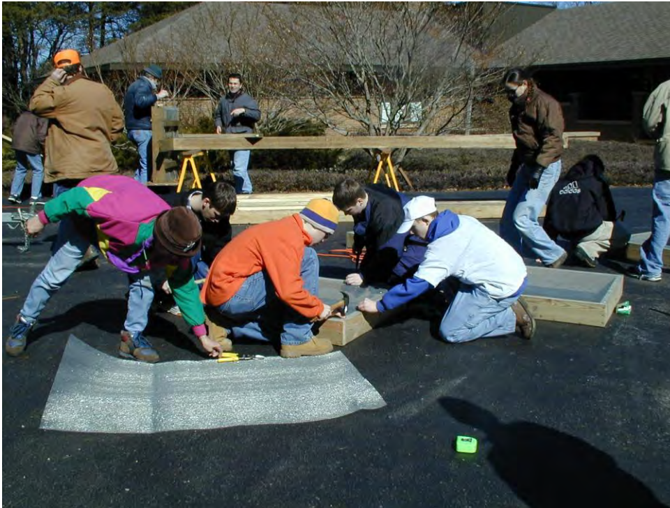
FIGURE 41: BOY SCOUTS MAKE NESTING PLATFORMS

This nest was built in 2001 and taken up in that same year. An osprey was making its nest on a muskrat house on the marsh plain, which meant a blow-in or storm tide would destroy it. It did not take this osprey any time at all to recognize improved housing.