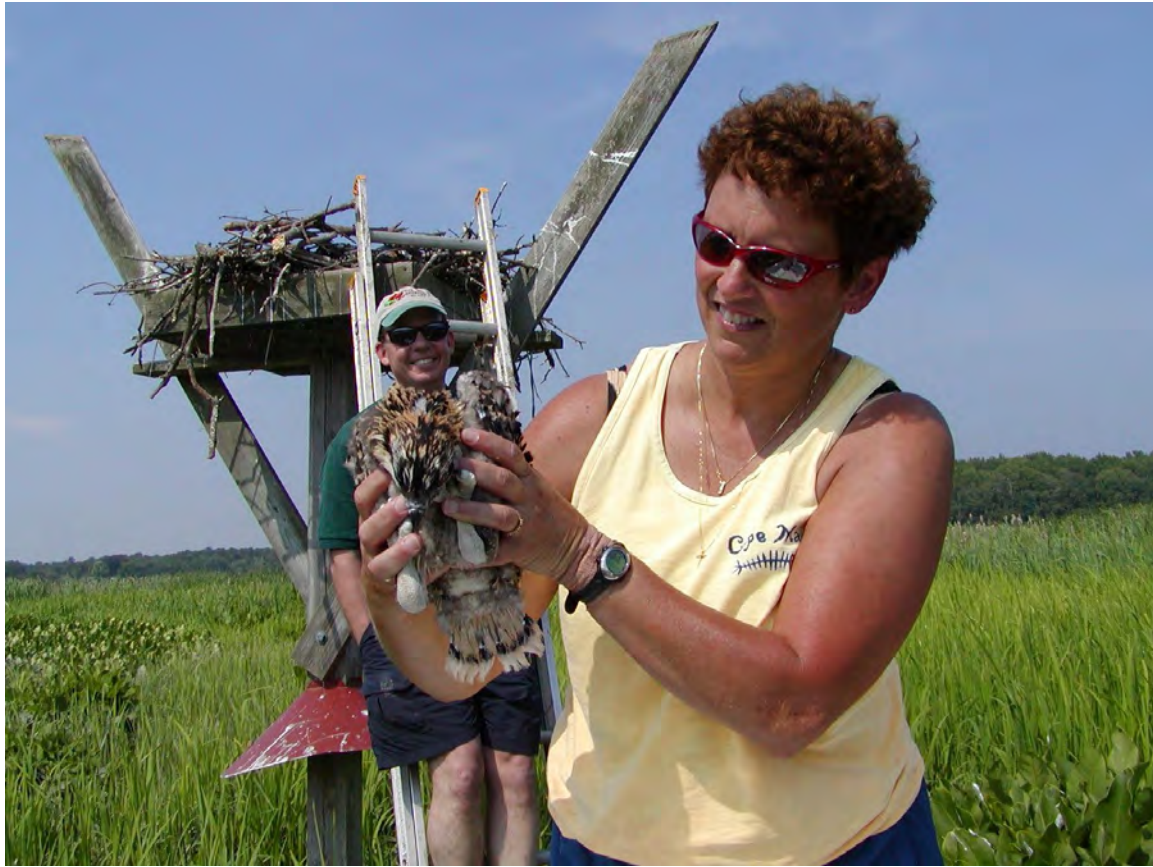
FIGURE 32: MILLVILLE CITY PLANNER HELPS BAND AT PEEK SOUTH

The northern nest was the first to be placed at the Natural Land Trust's Peek Preserve. It was very popular with preserve visitors, and the vastness of the meadow beacons accommodation for another pair of osprey. The refuge manager was supportive. Thus we constructed this nest, erected in 1996. It was an immediate hit with osprey returning from their South American winter break.