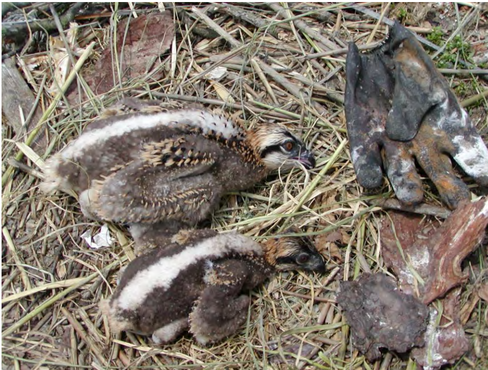
FIGURE 29: THIS GLOVE IS ONE OF NUMEROUS ITEMS FOUND OVER THE YEARS AT CAUSEWAY #2

This nest was one of four erected in 1995. This pair of ospreys has very eclectic taste in décor, making them one of the most interesting nests to visit on the river. The hodgepodge of items that they have brought to the nest really outdoes the other pairs. Likely the male brings these prized gifts to its mate. We have found a turkey wing, rope, a neoprene rubber glove, a goose call, fishing line (unfortunately we find fishing line all too often and the results are sometimes tragic), a tin can, and various assorted treasures. It is fun to read other accounts of what banders find in nests they visit.