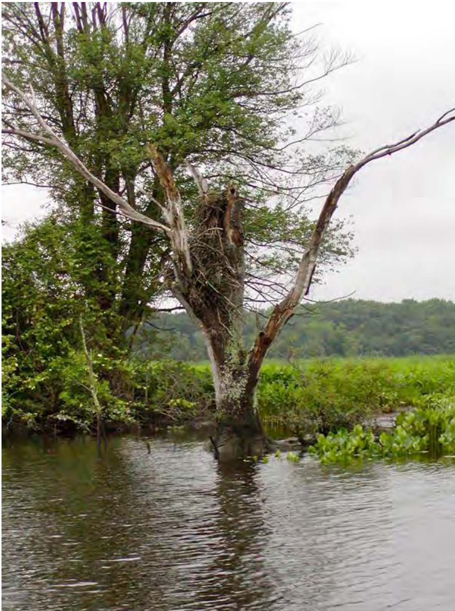
FIGURE 56: MOST NESTS BUILT ALONG THIS DIKE HAVE COLLAPSED.