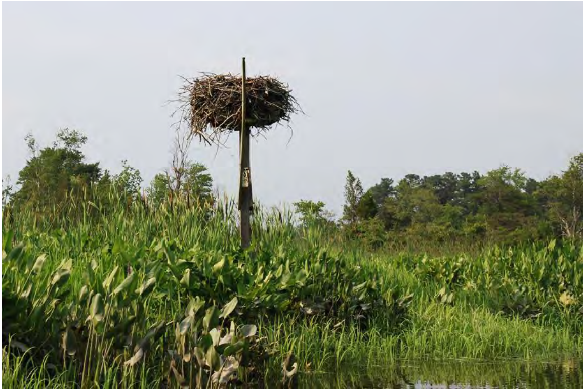
FIGURE 9: KIRBY NEST BUILDER BIRDS!