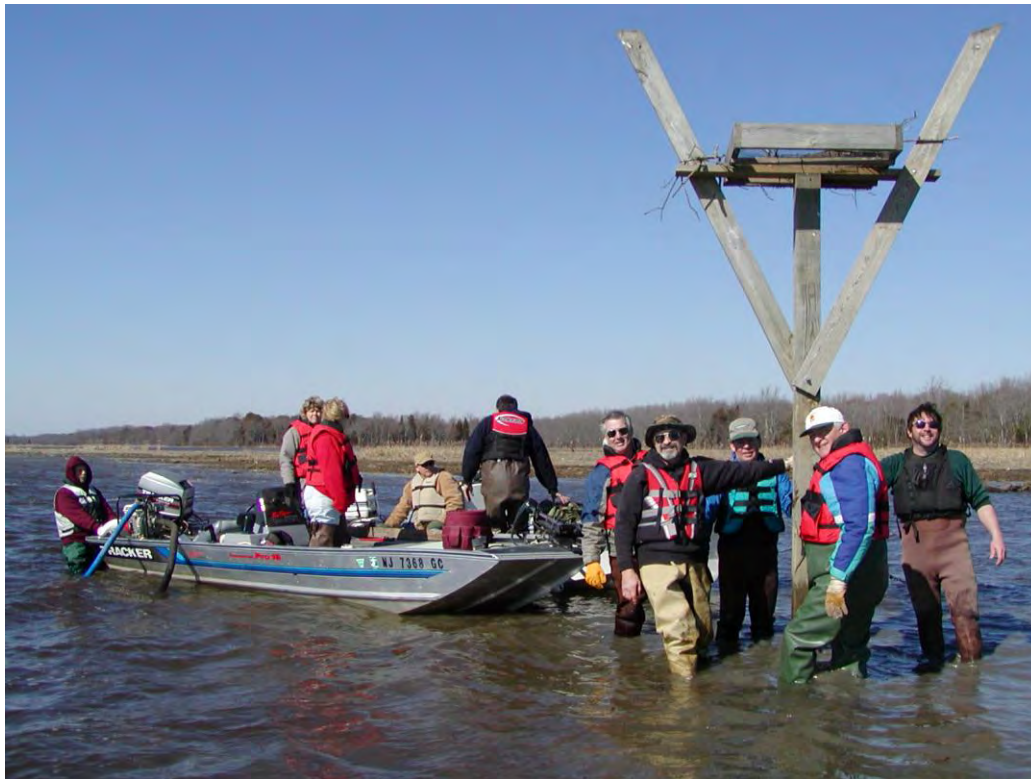
FIGURE 36: CREW PUTS UP BAUER NEST.

One day I witnessed a fantastic display of intolerance for geese by the osprey that nests closest to my home. The male osprey repeatedly dive-bombed a line of marching geese. And the reaction by the geese was to hit the deck in anticipation of the attack. In short course, the geese dispersed.