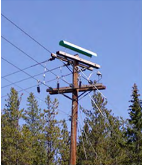
FIGURE 45: THIS OSPREY DETERRENT IS USED SUCCESSFULLY IN BRITISH COLUMBIA

This nest was along Route 47 in a Port Elizabeth church parking lot. The electric company put up the pole in an effort to lure the bird away from the existing electric pole that they fancied. The only problem was that it was too close and too similar to the electric poles. Most years, the birds were electrocuted on the nearby electric wires. The electric company was finally successful in discouraging the birds from using this pole. Initially, the church patrons were upset by our efforts to encourage the birds to abandon the site, until they learned of the electrocutions and our efforts to have the birds imprint to the safety of trees and our platforms. The church's preacher was instrumental in developing an understanding among the congregation.