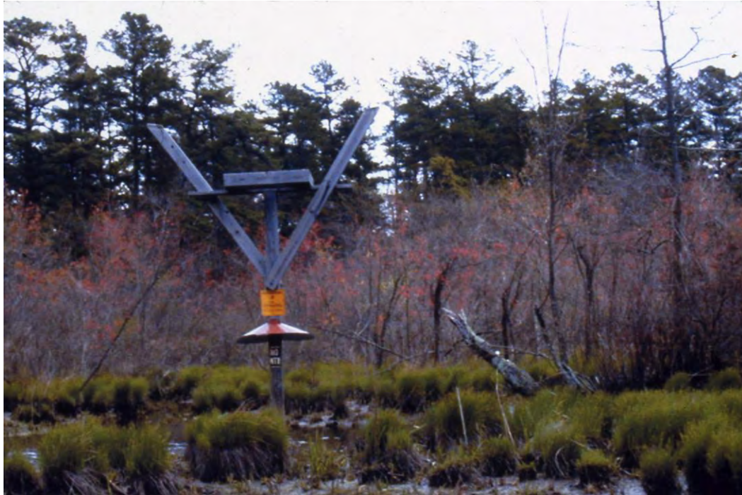
FIGURE 25: THE PROXIMITY TO TREE LINE PROBABLY MADE OSPREY FEEL INSECURE

This nest was ultimately removed. It was thought that the height of the trees and lack of a wide view might have been why no birds claimed it.