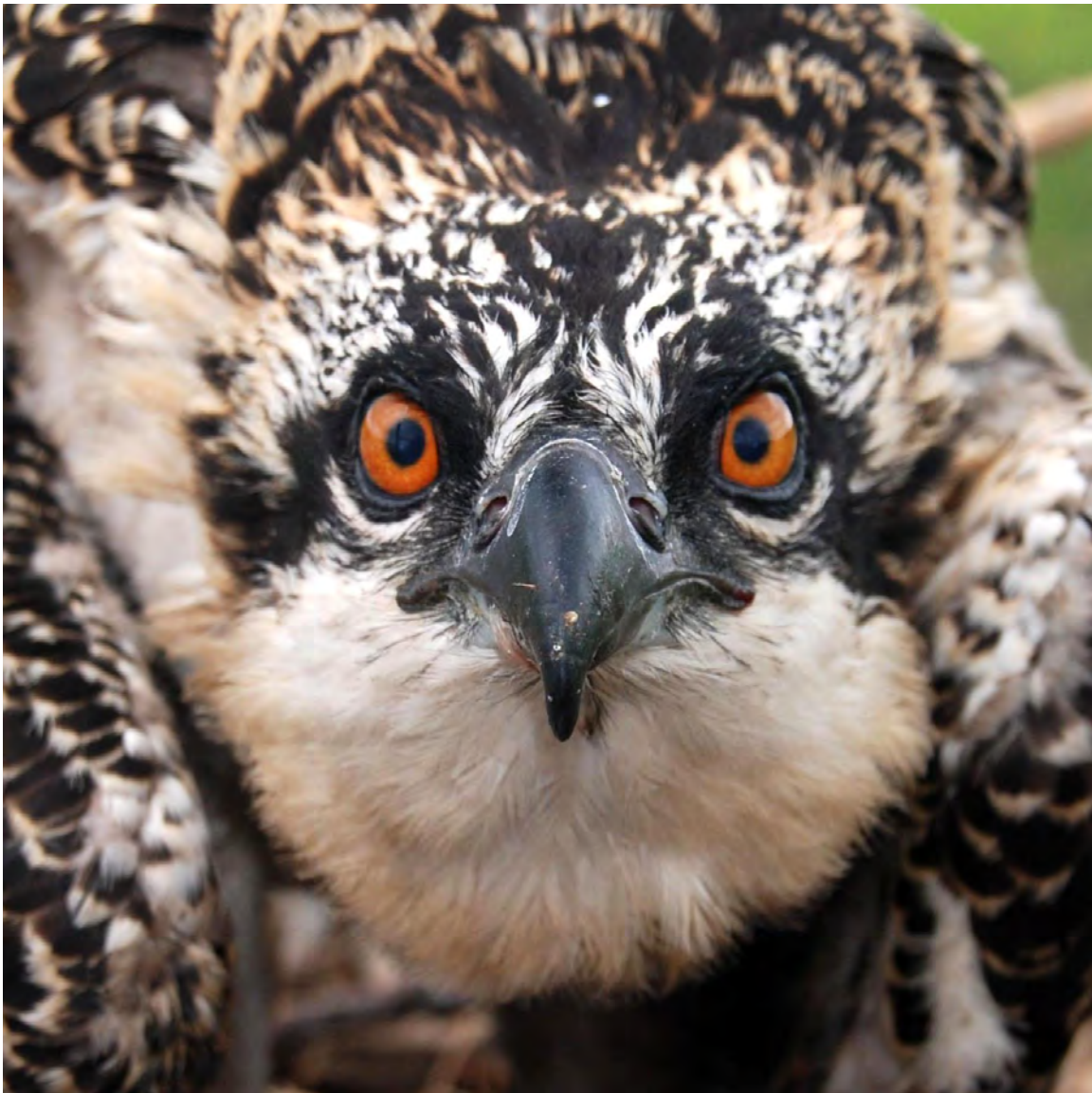
FIGURE 63: CHICK SURPRISED TO SEE BANDER AT CHUTE