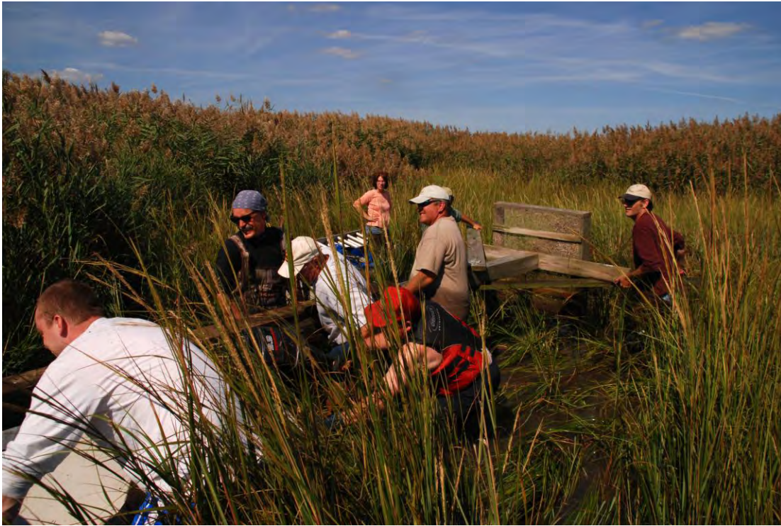
FIGURE 17: CREW MOVES CAUSEWAY NEST CLOSER TO RIVER'S EDGE