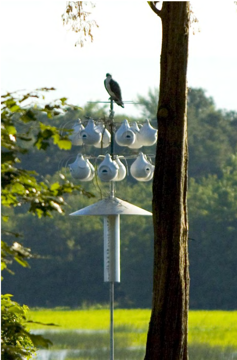
FIGURE 59: BEFORE PROVIDING OSPREY PLATFORM, BIRD CONTINUES TO TRY TO GET STICKS TO STAY ON TOP OF PURPLE MARTIN GOURDS.