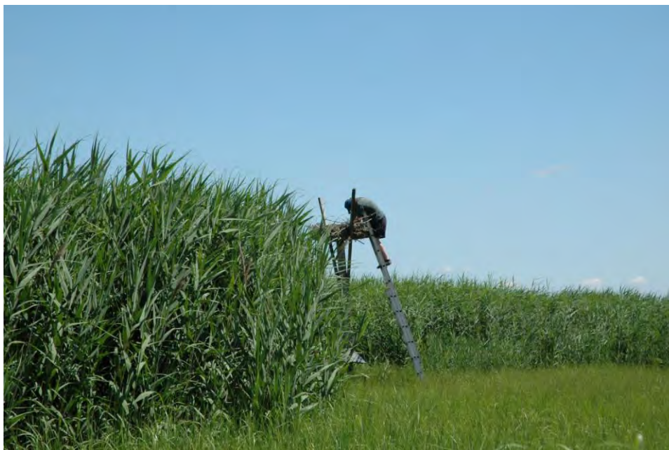
FIGURE 16: PHRAGMITES BEGIN TO TAKE OVER CAUSEWAY NEST #1

Today, the boat is NJ's Tall Ship, the AJ Meerwald, and it is owned by the Bayshore Discovery Project and in fact, it is a floating classroom. And now the dream focuses on the completion of a museum on site. And our osprey colony fledged 74 chicks in 2008. Any more skeptics out there?