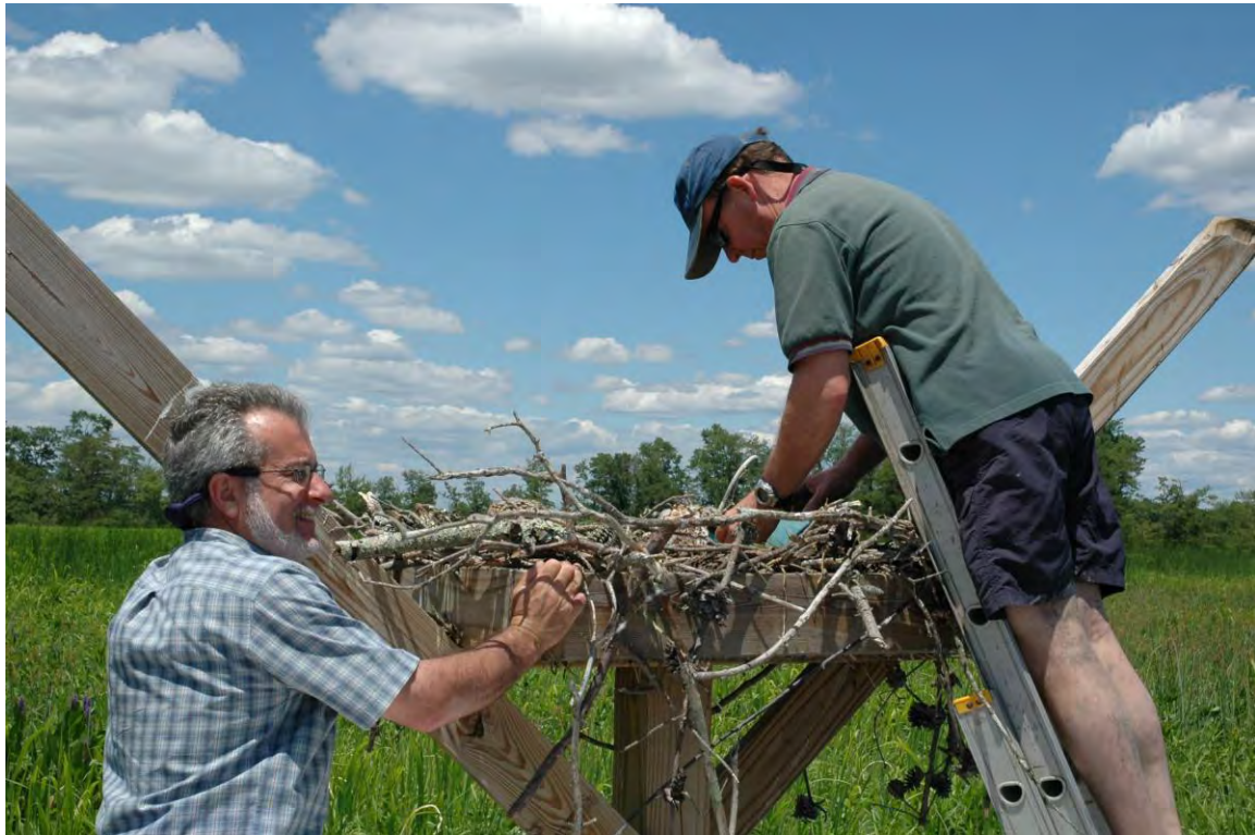
FIGURE 28: ASSISTANT GETS A PEEK AT CHICKS

This nest was one of four erected in 1995. At this point we were looking for locations that were rather far from the upland bank and were close enough to existing nests to make maintenance go faster. Additionally, we noticed over time, that when we worked on a nest, we drew a flying crowd of agitated onlookers. This is a colonial behavior and is effective in warding off intruders. It is likened to a mob of siblings showing up to protect a wronged sister. In this area there are at least nine nests visible in a half-mile radius. We affectionately call it the osprey ghetto. And it definitely has a “don't mess with us” atmosphere.