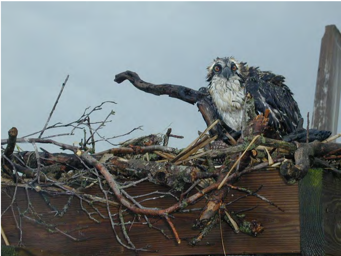
FIGURE 21: BEDRAGGLED CHICK IN VANAMAN PLATFORM AFTER A THUNDERSTORM