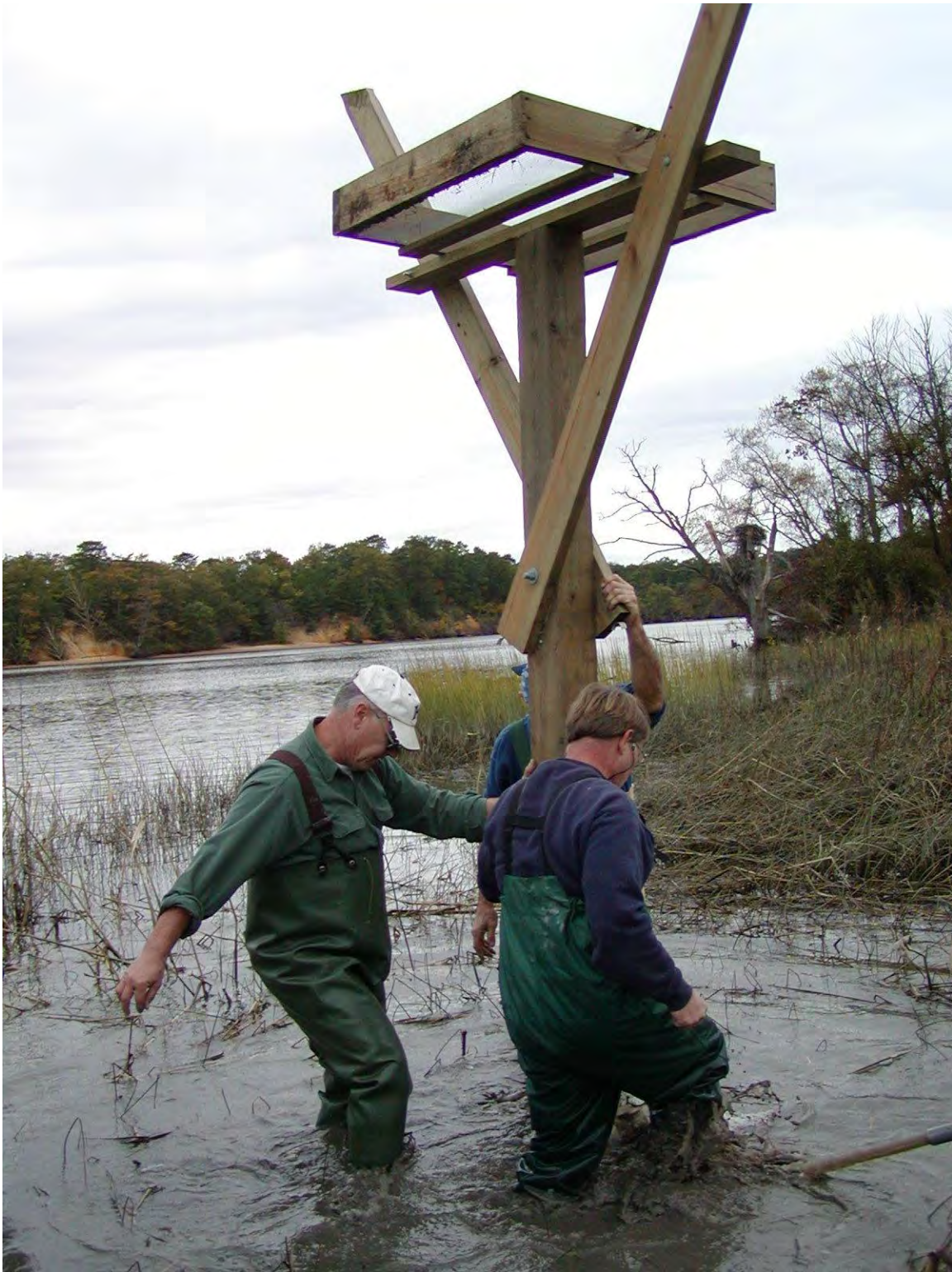
FIGURE 57: TAMPING IN MUD AT BASE OF NEST AFTER HOISTING, NOTICE NATURAL NEST IN BACKGROUND.