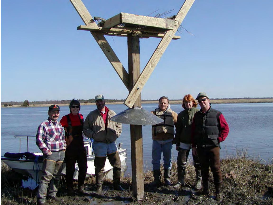
FIGURE 47: CREW JUST FINISHED INSTALLING FISHER / BARBOSE PLATFORM

This nest was sited in 2002. It is named for the closest residence and property owner and their neighbor, who diligently make observations of the osprey. Having stewards of the nests has saved young and protected birds on a number of occasions. Sometimes the reports and observations of our nest stewards have enabled us to rescue birds wrapped in fishing line and avert other types of disasters.