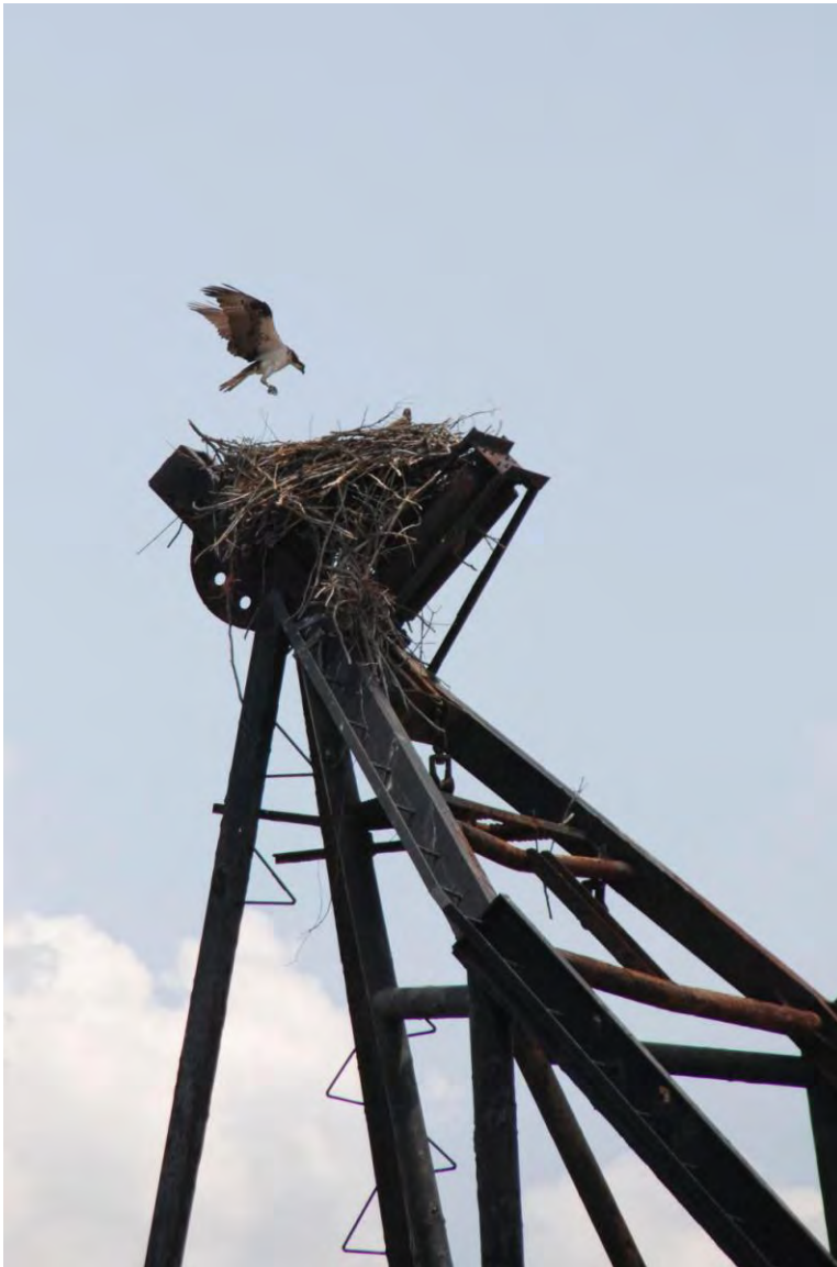
FIGURE 38: BIRD BUILDS ON CLAM DREDGE AT DORCHESTER SHIPYARD