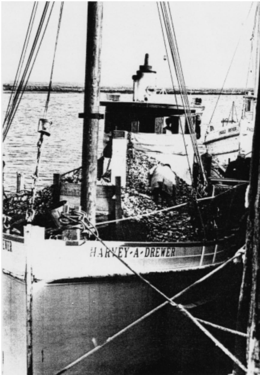
Delaware oystermen at dockside.

In the spring of 1957, oysters began to die on leased grounds in